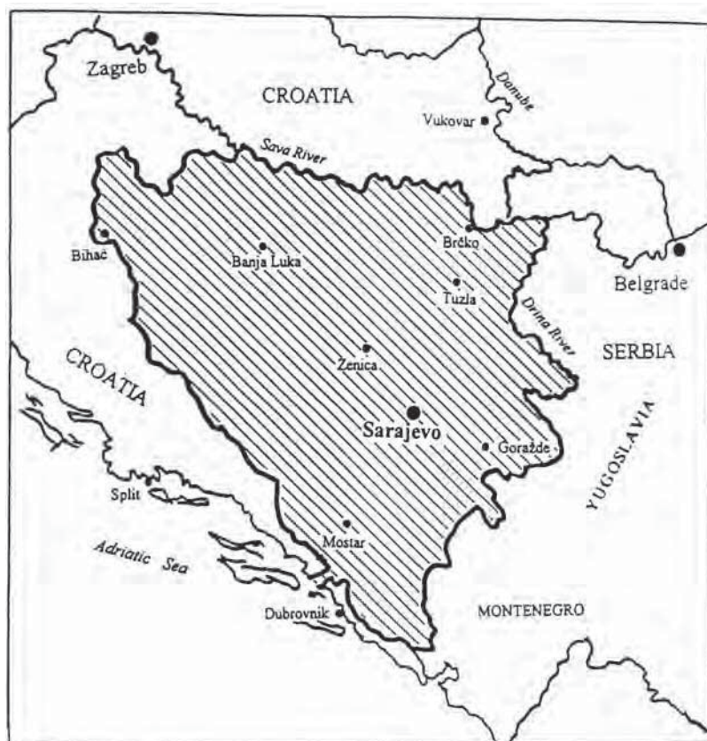
Bosnia and Herzegovina after 1945