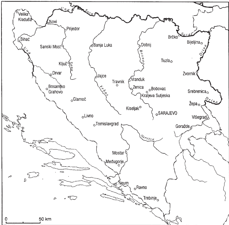
Bosnia and Herzegovina