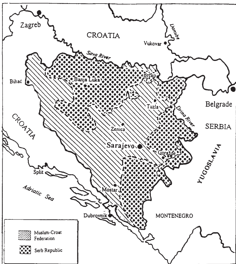
Bosnia and Herzegovina after the Dayton Peace Accords, November 1995