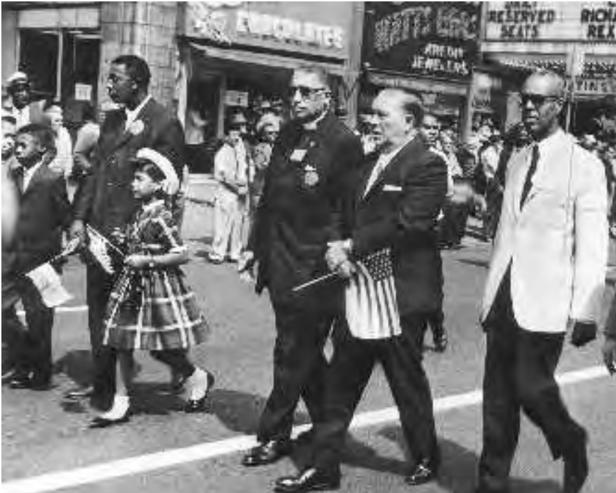
Mayor Richard Daley of Chicago, marching in a civil rights march, 1963. On his left is NAACP leader Roy Wilkins.

But even as official labor's importance within the Democratic Party electoral machinery increased, its ability to speak convincingly for the general welfare declined. Institutional stability brought many benefits to the unions and their members, but these came at the cost of a sense of social mission. Every year at annual conventions, delegates adopted resolutions pledging support for a wide range of ambitious social reforms, but few people in or out of the labor movement took them very seriously. Unions existed primarily to service the needs and represent the interests of their own members, not to