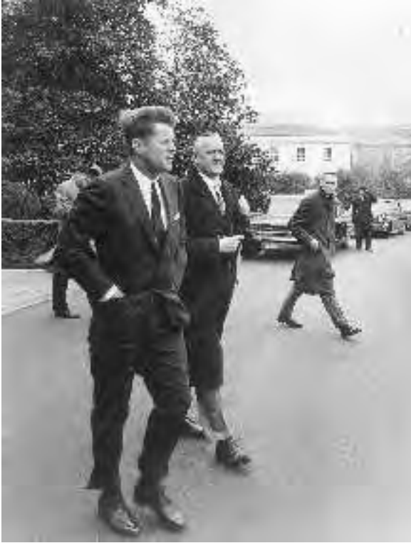
President John F. Kennedy.

Pride of place fell to John (nicknamed Jack) after his older brother, Joseph, Jr., died in a World War II plane crash. John suffered from a variety of physical ailments that frequently confined him to bed and plagued him throughout his life. But his father still demanded that the boy join his siblings in rigorous physical exercise, sailing races, and touch football games. His mother, Rose Kennedy, herself the daughter of a prominent Irish-American politician in Boston, pinned notes to his pillowcase urging him to memorize the presidents. Competition was the family creed. “Don’t play unless you are captain,” Joe Kennedy, Sr. advised his brood. “Second place is failure.” 25