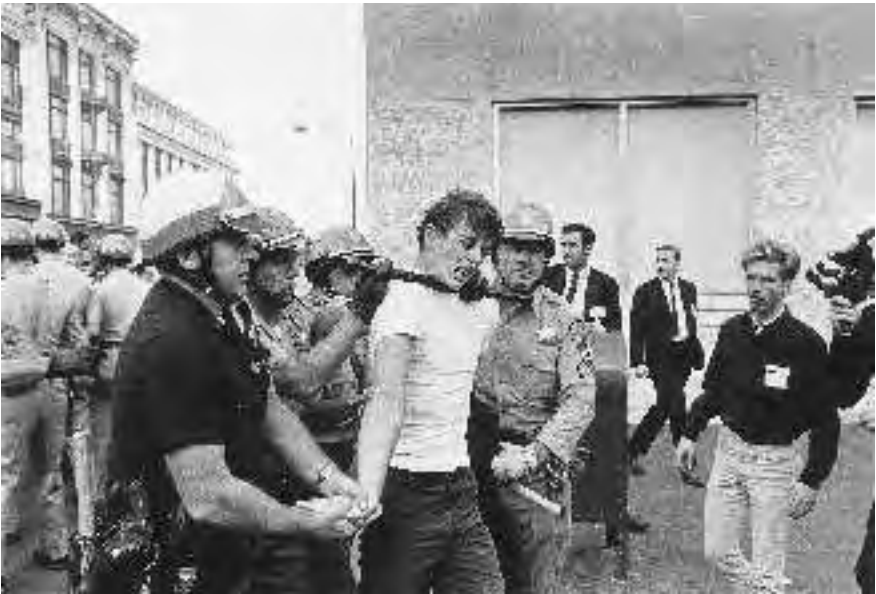
A demonstrator arrested during Stop the Draft Week, Oakland, California, October 1967.

For some on the New Left, their newly acquired revolutionary convictions argued against devoting too much energy to antiwar protest, which was