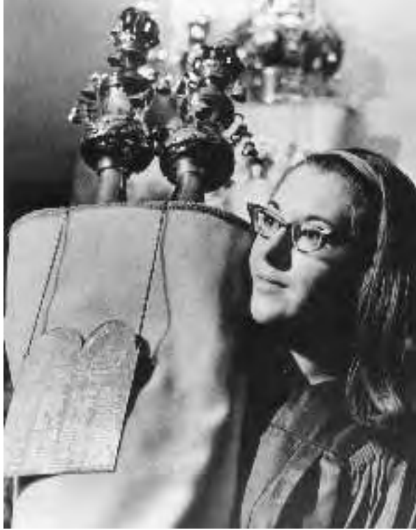
Sally Priesand, the first American woman ordained as a rabbi, 1972.

Paul Newman, playing a Jewish guerrilla fighter, threw at his Christian lover (played by Eva Marie Saint): “People are different. They have a right to be different. They like to be different. It’s no good pretending that differences don’t exist.” 27 The assertion of Jewish distinctiveness articulated the same hunger for an authentic, moral life that was moving many Christians away from liberal churches and back to a living God.