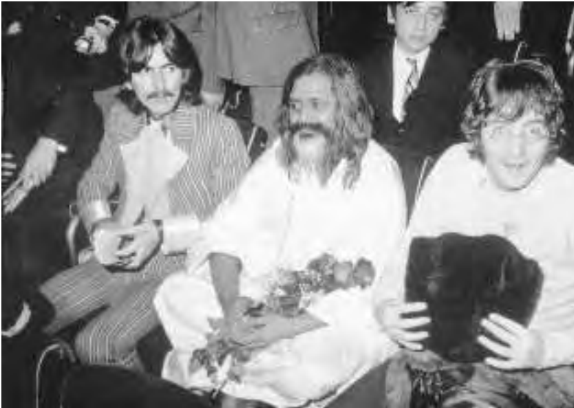
Maharishi and the Beatles.

Early in the 1970s, the maharishi, who had returned to India, engineered a shift away the counterculture and toward a more practical, even rationalistic appeal. He and his disciples began to describe TM as the "science of cre-