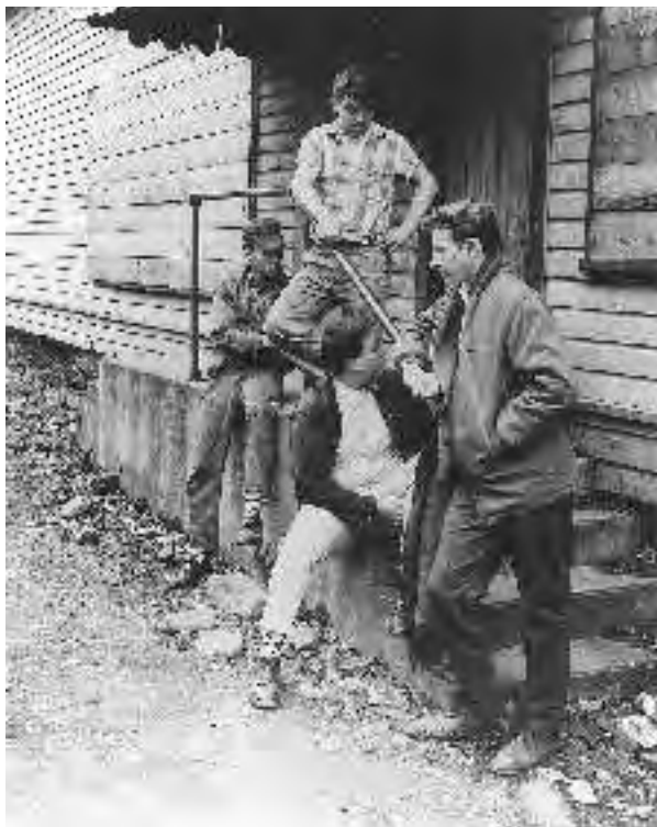
Unemployed young men in West Virginia, c. 1961. The Great Society aimed to lift them out of poverty.

1964, Johnson announced that his administration, “today, here and now, declares unconditional war on poverty in America.”