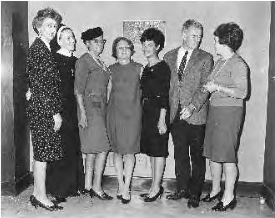
Betty Friedan, at center, and other founders of the National Organization for Women, 1966.

Friedan’s feminist egalitarianism, like King’s racial egalitarianism, struck a responsive chord among many Americans in the 1960s; The Feminine Mystique would go on to sell a million copies.