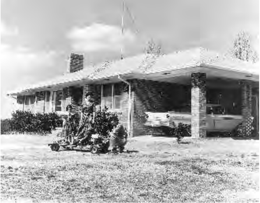
A white working-class family outside their suburban home in the late 1950s.

nied by a steady increase in the number of women entering the paid labor force. Women over 45 led the way, swelling the professions and the ranks of office workers. The number of married women with jobs had risen since the war. But the family “breadwinner” was still assumed to be male; fewer than 250,000 women with small children worked outside the home.