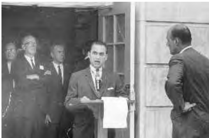
George Wallace announcing his refusal to submit to a federal order to open the University of Alabama to black students, June 1963. Deputy Attorney General Nicholas Katzenbach glares at him from the right.

Wallace's defiant posture, cleft chin and back straight, before the taller Katzenbach made him seem a plebeian descendant of Confederate heroes, doing battle again with the federal dragon. Slaying the beast might be impossible, but the pugnacious governor had set the terms for future combat. George Wallace had converted his failure to stop two black students from attending a public university into a potent symbol of protest against a federal government toward which most white Americans had always felt uneasy. "Wallaceism is bigger than Wallace," Martin Luther King, Jr. told an interviewer soon after the drama in Tuscaloosa, ". . . I am not sure that he believes all the poison he preaches, but he is artful enough to convince others that he does." 20