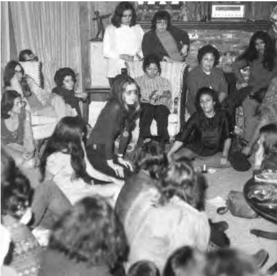
Gloria Steinem (hands on knees), speaking with a consciousness-raising group, c. 1970.

After fielding a tightly organized and smoothly run primary campaign, McGovern stumbled badly in the general election. Among the most famous gaffes of the campaign was McGovern's decision to first offer the vice-presidential nomination to Senator Thomas Eagleton of Missouri, and then, after it was revealed that Eagleton had been hospitalized for mental problems (and after McGovern pledged to stand "one thousand percent" behind his nominee) to dump Eagleton for Sargent Shriver. The Eagleton affair struck hard at McGovern's public image as a man of high principle, making him look instead like just another poll-driven, wavering politician. As a liberal standard-bearer, McGovern also lacked the stage presence of a John or Bobby Kennedy. The son of a Methodist minister, McGovern came across to many listeners as a kind of mild and ineffective pastor, disappointed in the worldly ways of his flock. Rolling Stone's political correspondent Hunter S. Thompson, who