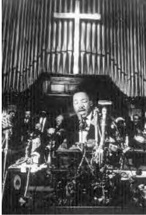
Martin Luther King, Jr., giving one of his last speeches, 1968.

. . . Sing it real pretty!” Moments later, a rifle bullet tore into the right side of King’s face, and the great orator never spoke again. Earlier that day, King had called to arrange the Sunday sermon at his own Ebenezer Baptist Church back in Atlanta. The title he gave was “Why America May Go to Hell.” 14