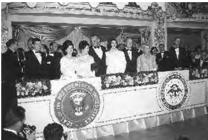
Lyndon Johnson, Hubert Humphrey, and their families celebrate their inauguration, January 20, 1965.