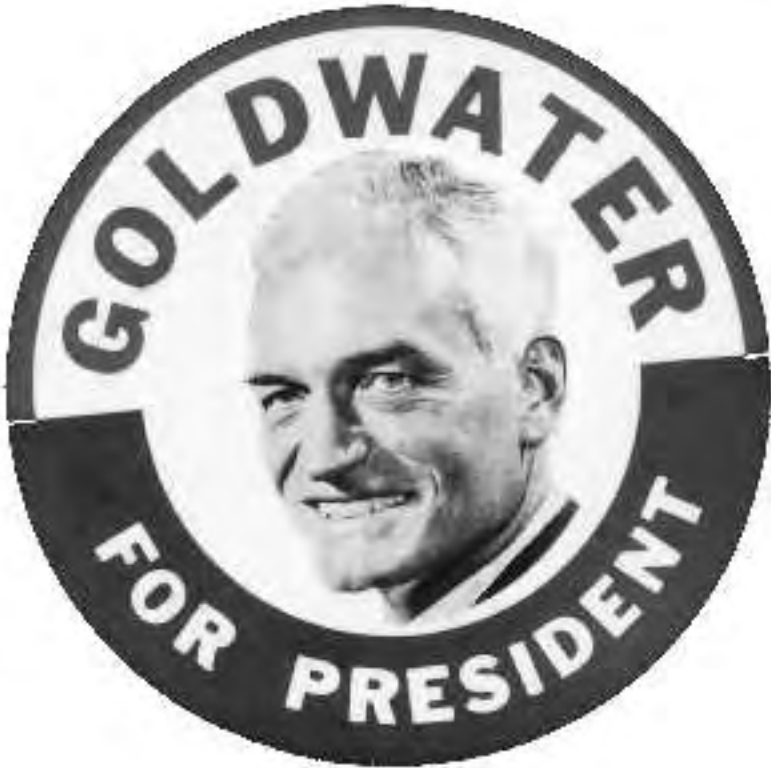
"In Your Heart, You Know He's Right"—The 1964 Republican candidate.

avored allowing NATO commanders to use nuclear weapons against the Soviets, if they decided that were necessary. "In Your Heart, You Know He's Right," read his billboards and bumper stickers. A pro-Johnson wag changed the GOP slogan to read, "In Your Guts, You Know He's Nuts."