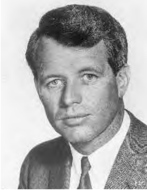
Robert F. Kennedy, during his 1968 presidential campaign.

of SDS activists came in hopes of convincing McCarthy supporters that change within the party system was unattainable.