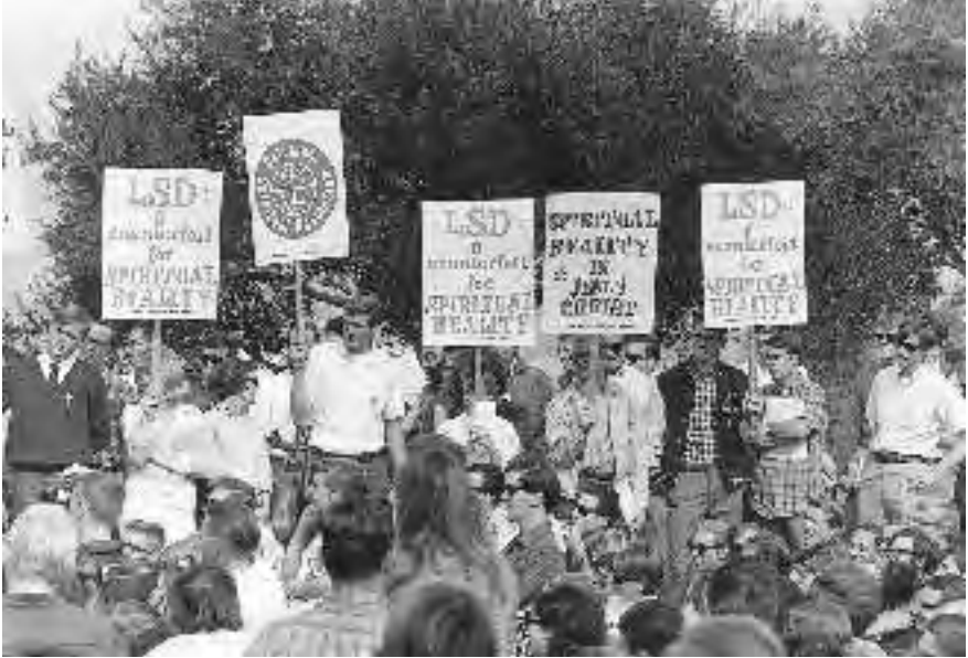
Young evangelists rally for Christ at the University of Texas, Austin, 1969.

A murmur of armageddon ran through this sprouting network. Leading evangelists believed the world was approaching the end of time. Very soon, Jesus would return to earth and render His judgment. In 1970 Hal Lindsey, former leader of the Campus Crusade at UCLA, published a dramatic synopsis of these ideas, entitled The Late, Great Planet Earth . Over the next decade, his book, which referred to the Antichrist as “The Weirdo Beast” and “the Rapture” as “The Ultimate Trip,” sold more than 9 million copies. 11 Serious theologians scoffed, but Lindsey had tapped into the same sense of dire crisis and wild optimism that gripped many on the secular Left. SDS and the Black Panthers expected that some kind of socialism would emerge from the ashes of the U.S. empire. Lindsey and his fellow premillennialists (at times, including Billy Graham) were similarly convinced that the Second Coming would perfect the world.