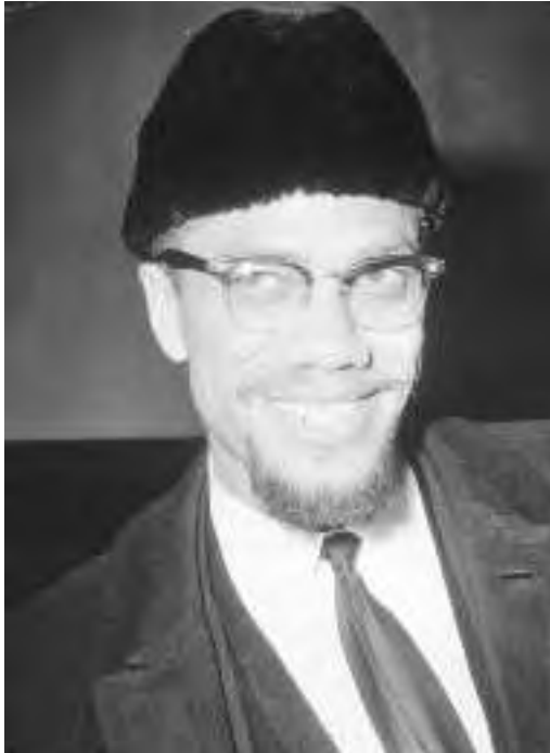
Malcolm X, leading voice of black nationalism in the late 1950s and early 1960s.

In 1963 Malcolm made his most important convert—the heavyweight boxer Cassius Clay. As a youth in Louisville, Clay had been vocal about his hatred for white power. He responded to the murder of Emmett Till by throwing stones at a U.S. Army recruiting poster. In 1960, Clay won a gold medal