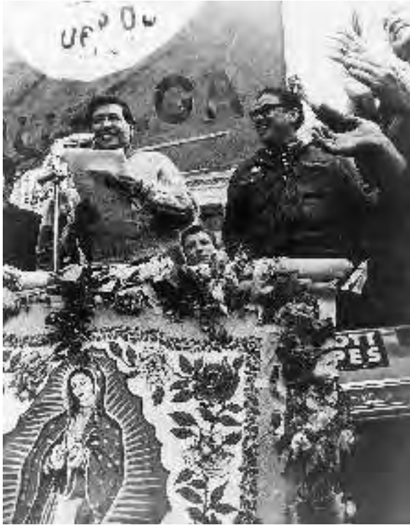
Cesar Chavez, leader of the United Farm Workers, during a rally to support the grape strike and boycott, 1965.

strike against the grape growers of the San Joaquin Valley. Rapidly, the work stoppage mushroomed into a peaceful uprising by an ethnic group the Anglo majority had long disparaged. In mass demonstrations, including a 300-mile march to the state capital, union workers held aloft banners emblazoned with a black Aztec eagle on a bright-red background and others adorned with the image of Our Lady of Guadalupe, the patron saint of Mexico. Chavez called the movement “both a religious pilgrimage and a plea for social change,” and, throughout the Southwest, “La Causa” sparked a political awakening among Mexican Americans who had been relatively quiescent before. 52