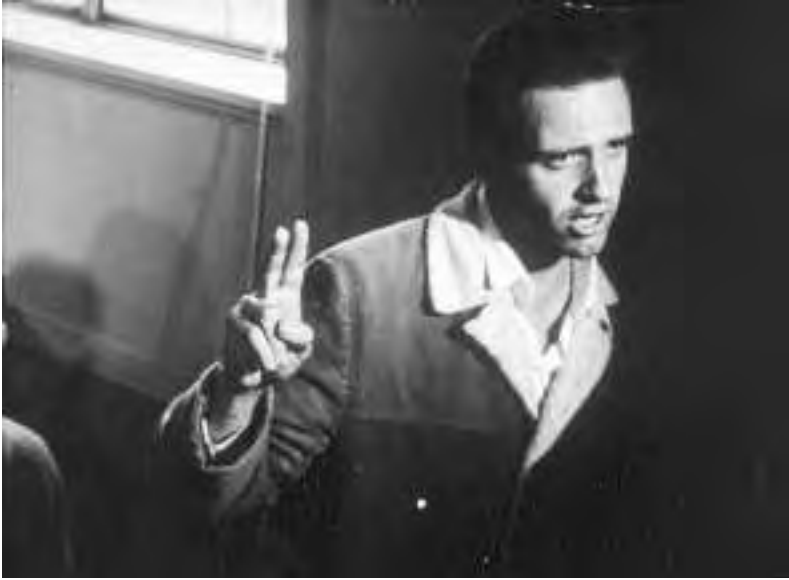
Mario Savio, leader of the Free Speech Movement at the University of California, Berkeley.

away from the official agendas of the “liberal establishment” in Washington and elsewhere.