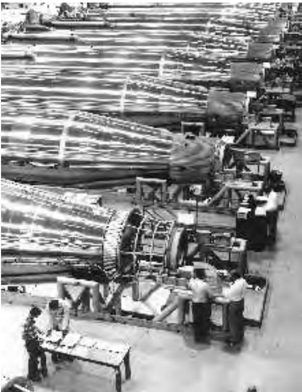
Workers and engineers complete production of Atlas ICBM missiles at a General Dynamics Plant near San Diego, 1958.

Dwight Eisenhower’s America held sway over a Western world that, since the late 1940s, had been undergoing a golden age of economic growth and political stability in which the lives of ordinary people became easier than ever before in world history. 2 U.S. political and corporate leaders dominated the noncommunist world through military alliances, technologically advanced weaponry, democratic ideals, and consumer products that nearly everyone desired—from Coca-Cola to Cadillacs to cowboy movies. At home, American workers in the heavily unionized manufacturing and construction industries