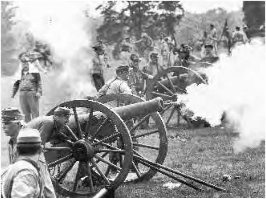
Mock confederates fire on mock Union soldiers during the centennial reenactment of the Battle of Bull Run, July 1961.

“One hundred years of delay have passed since President Lincoln freed the slaves . . . [T]his Nation, for all its hopes and all its boasts, will not be fully free until all its citizens are free.” 7 Two years later, in May 1965, Martin Luther King, Jr. stood on the same statehouse steps in Montgomery where Governor Wallace had thrown down the gauntlet of segregation. There, before an audience of 25,000 supporters of voting rights, King ended his speech with the exaltedly defiant words of the Battle Hymn of the Republic: