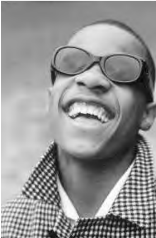
Stevie Wonder, one of Motown’s most talented and popular artists.

Little Stevie Wonder’s “Fingertips, Part 2” held down the #1 spot in the nation for three weeks that year. Wonder was then only 12 years old, hence the diminutive nickname. Blind since birth, the boy christened Stevland Morris was indeed a musical wunderkind . He had signed a contract with Motown