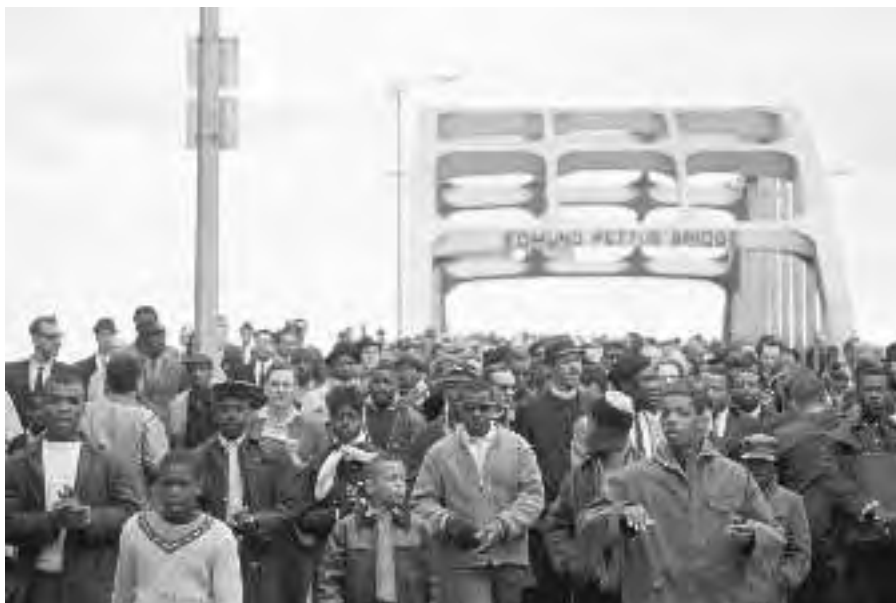
Demonstration at Selma, March 1965.

phalanx of club-swinging and yelling troopers and posse members slammed into the column. As tear gas billowed across the scene, newspaper photographers and television news cameramen recorded the ensuing chaos. Men, women, and children were beaten to the ground with billy clubs, cattle prods, and bull whips; one posseman beat retreating marchers with a rubber hose wrapped with barbed wire. Some marchers were ridden down by horses; others jumped or were pushed from the bridge to the water below. John Lewis was struck on the side of the head with a billy club; he remembered thinking as he fell to the ground, "People are going to die here. I'm going to die here." Rebel yells could be heard over the screams of the beaten, as well as the voice of Sheriff Clark yelling "Get those god-damned niggers!" 21 Dozens of marchers, including Lewis, required hospitalization for concussions, lacerations, and broken bones. In the spring of 1965 the voting rights struggle in Selma provided the nation a tableau of violent conflict and redemptive suffering that would move President Johnson to compare its historical significance to the battles of Lexington and Concord.