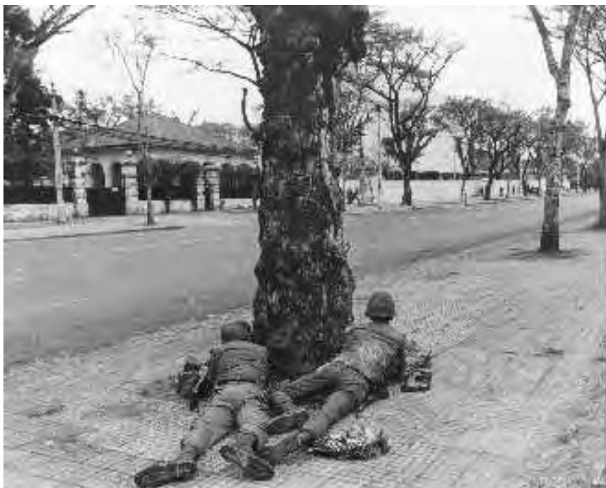
American marines prepare to take back the U.S. embassy from Viet Cong commandos, January 31, 1968.

who to that point had been uncritical of the war effort, spoke for many Americans when he intoned on the evening news that it was “more certain than ever that the bloody experience of Vietnam is to end in stalemate.” Clark Clifford, then the new secretary of defense, later confessed, “Tet, to me, was the roof falling in.” 2