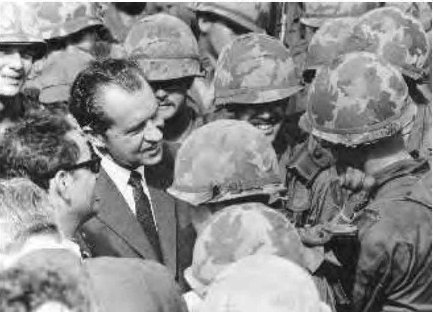
President Richard Nixon, visiting the U.S. troops in South Vietnam, c. 1970.

There was one week in the year that followed that seemed to live up to the promise of the new president's call for national unity. That was the seven days in mid-July that witnessed the Apollo XI mission. Three American astronauts flew to the moon on the spacecraft Columbia , and two of them, Neil Armstrong and Edwin Aldrin, landed on its surface on July 20 in the module Eagle. People around the world watched live televised images of Armstrong and Aldrin standing before an American flag planted on the moon's surface, redeeming the pledge that John Kennedy had made eight years earlier. Before reboarding their landing module, Armstrong and Aldrin left behind them a plaque bearing the words "We came in peace for all mankind." Nixon flew to the South Pacific to be on hand on the U.S. aircraft carrier Hornet when Apollo XI splashed down three days later. Understandably elated,