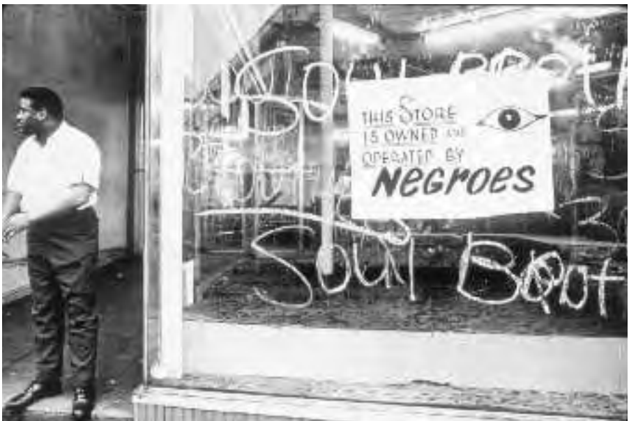
Warding off looters during the riot in Newark, July 1967.

Moynihan described what he called a “tangle of pathology” that had undermined the urban black family in recent years. Moynihan’s intention in analyzing black family structure was fully in conformity with the reformist goals of the war on poverty, and drew heavily on studies of ghetto life by black social scientists like E. Franklin Frazier and Kenneth Clark. There were also echoes of Gunnar Myrdal’s An American Dilemma , including the phrase about “pathology.” The instability of many black families, as measured in rates of divorce or abandonment, illegitimacy, female-headed families, and welfare dependency, was as Moynihan described it, a historical legacy of slavery, reinforced by the continuing high rates of black male unemployment, and the fact that AFDC payments were available only to households without an adult