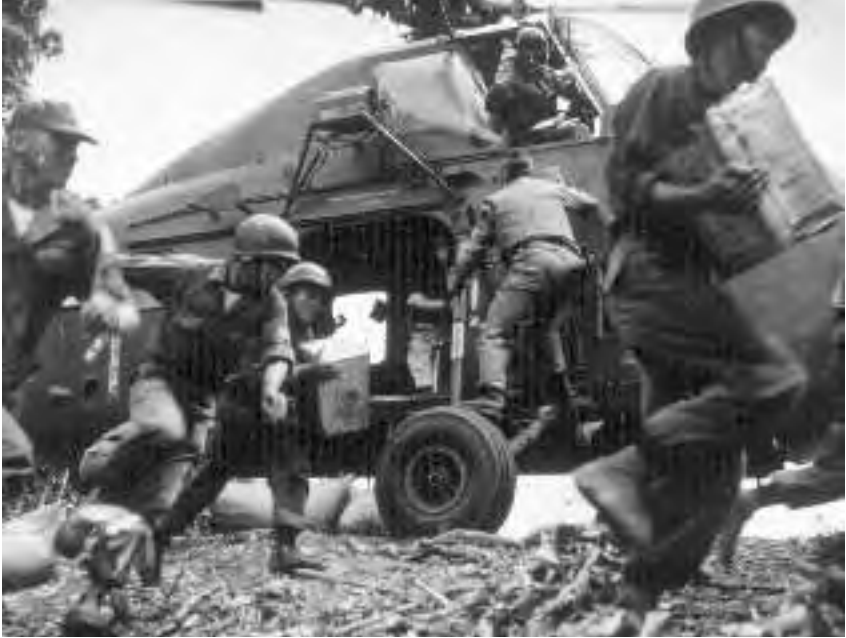
A marine helicopter manned by an American advisor supplies South Vietnamese Army troops, 1964.

Cong ambush on December 22, 1961, the first “official” U.S. death in the Vietnam War.