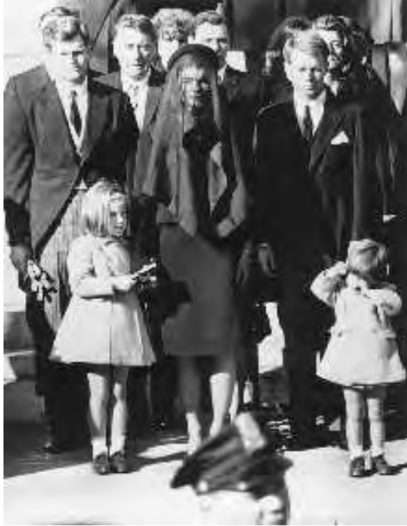
At John F. Kennedy's funeral. His widow Jacqueline, stands with her children, Caroline and John. Flanking them are his brothers Edward and Robert.

strip-club owner named Jack Ruby, who was friendly with the Dallas police. Part is due to Oswald's earlier defection to and return from the Soviet Union and his subsequent passionate support of the Cuban revolution. Part can be blamed on a "rush to judgment" by the Warren Commission, which the new president, Lyndon Johnson, appointed to investigate the killings. The commission published its final report in September 1964, only 10 months after the events in Dallas. And even its defenders later acknowledged that President Johnson, the Kennedy family, and the FBI pressured the panel of jurists and politicians to confirm that both Oswald and Ruby had acted alone and lacked any motivation other than personal rage. The fact that Johnson expanded U.S. troop strength and firepower in Vietnam, with disastrous conclusions, also led to speculation that his beloved predecessor was killed because he had begun to doubt the wisdom of the war.