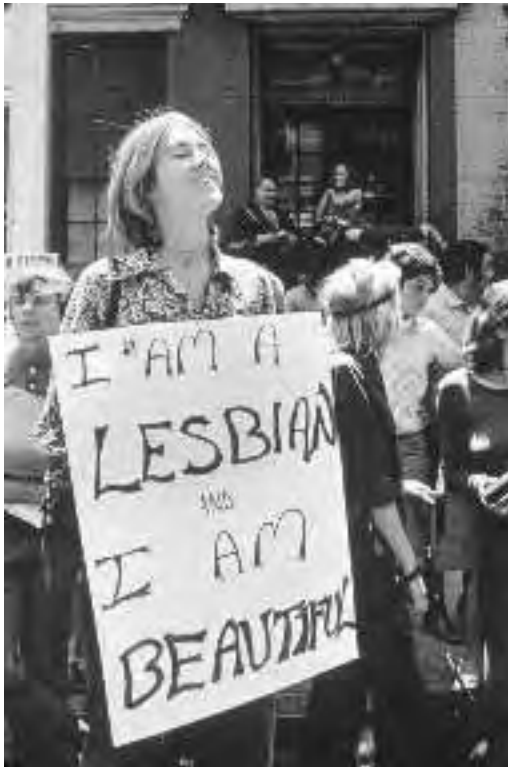
At a gay rights demonstration, 1970.

Another insurgency making headway in the years of the Nixon presidency was the environmental movement. In September 1969, Wisconsin Senator Gaylord Nelson, proposed that a national “teach-in” be held the