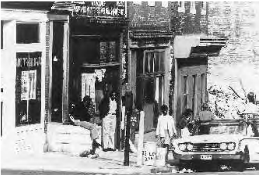
A street corner in Harlem, New York City, in the early 1960s.

Nor could hopeful rhetoric persuade white homeowners to open their neighborhoods to newcomers of a different race or white politicians to jeopardize their careers for the cause of racial equality. Residential segregation meant that the public schools were also divided by race; and whites who dominated school boards tended to channel funds disproportionately to schools attended by children who looked like them. The small but growing black middle class—