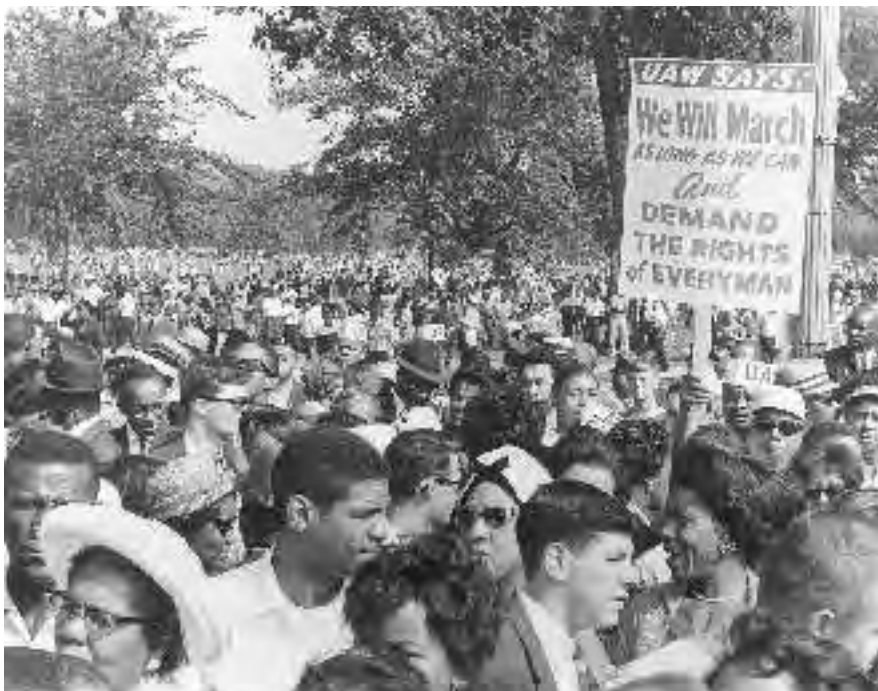
Part of the crowd of 250,000 at the August 1963 March on Washington for Jobs and Freedom.

where Martin Luther King, Jr. gave a different version of the “I Have a Dream Speech,” which Motown had earlier recorded in Detroit. The integrated crowd was in a hopeful mood; perhaps the nation was finally beginning to cleanse itself of racism. But Dylan, characteristically, was dubious. Near the end of the day, he looked over toward the Capitol and grumbled, “Think they’re listening? No they ain’t listening at all.” 31