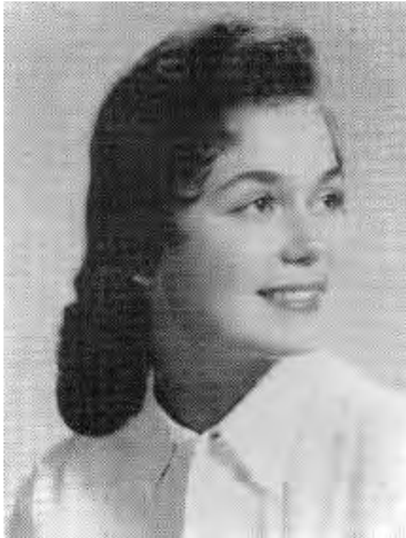
Gloria Steinem, future feminist leader, as she appeared in her 1956 college yearbook.

for the group, carefully hidden from the delegates but probably known to Steinem, came from the Central Intelligence Agency. Steinem, however, did not think of herself as the covert agent of a great power. Upon her return from Vienna in August 1959 she wrote to a relative: "I suppose this was my small world equivalent of going off to join the Spanish Revolution." 17