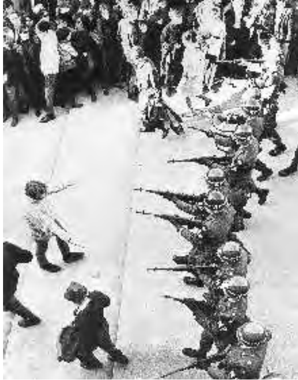
March on the Pentagon, October 1967.

The Pentagon did not levitate, but 30,000 marchers did bring the anti-war message to within shouting distance of the building. Several thousand of the most militant broke through lines of federal marshals, soldiers, and National Guardsmen and reached the side of the building. A few carried Viet Cong flags; others put flowers in the gun barrels of the young soldiers who surrounded their encampment. There they sat and sang and yelled “Join us!” to the soldiers. Some urinated on the side of the building; a few threw rocks at the military police. As dusk arrived, the marshals moved in with clubs and tear gas, and nearly 700 were arrested. 48