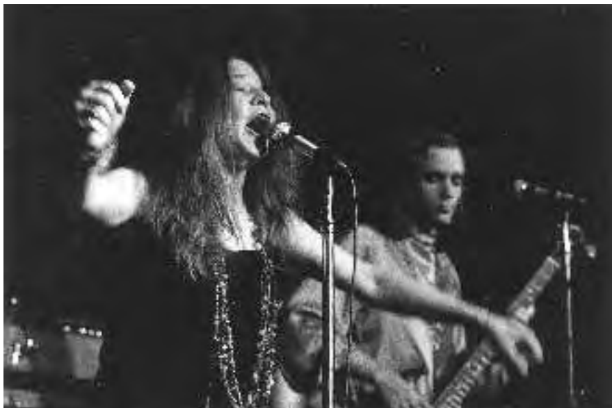
Janis Joplin with Big Brother and the Holding Company, 1968.