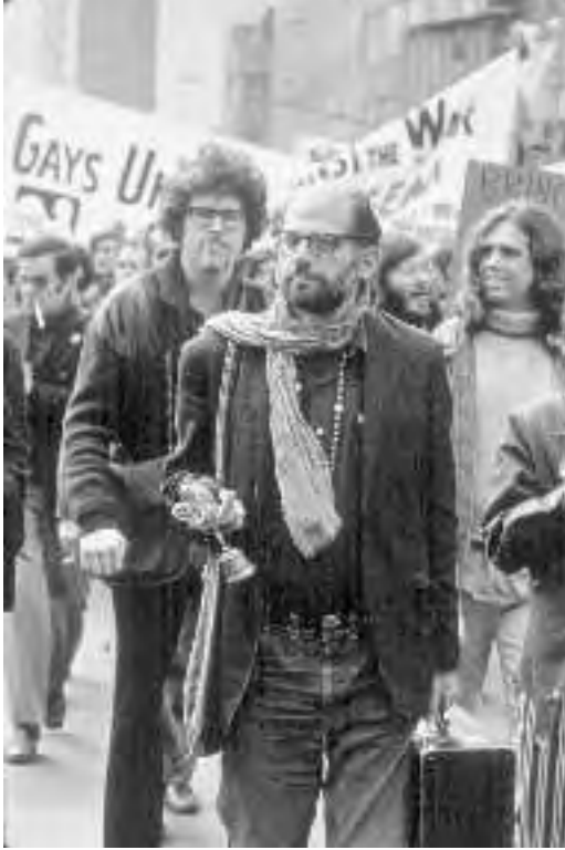
Allen Ginsberg, c. 1970.

set of wooden drums that he played at all hours, and harvested cocoa beans alongside Mayan Indians. He hitchhiked to Florida, flew to Cuba in expectation of orgies that did not occur, and then returned to Greenwich Village.