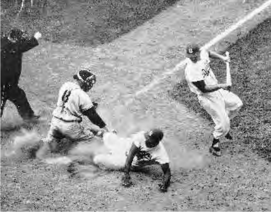
Jackie Robinson being tagged out at home during a World Series game against the New York Yankees.

best educational institutions. After the war, increasing numbers of blacks finished high school and gained entrance to historically white colleges; the number of African Americans in the skilled trades and in professions like medicine and education shot up.