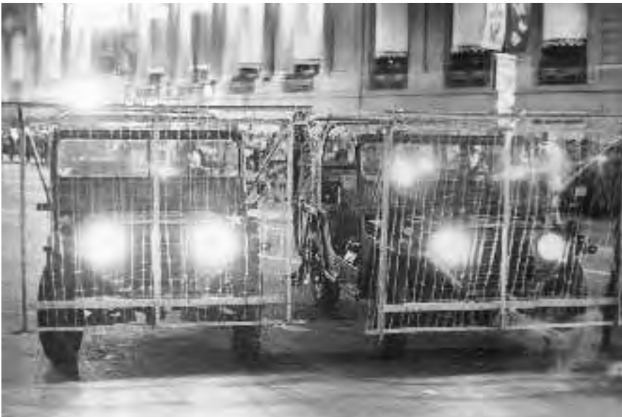
The war at home: National Guard jeeps outfitted for a riot during the Democratic Convention in Chicago, August 1968.

They need not have worried. Most Americans sided with Richard Daley and his police. After both Democrats and protesters had departed, the mayor refused to apologize: “This administration and the people of Chicago,” he said, “would never permit a lawless, violent group of terrorists to menace the lives of millions of people, destroy the purpose of a national political convention and take over the streets.” 30 Polls found that respondents, by a margin of almost 2 to 1, approved of his actions. CBS, the leading network at the time, received thousands of letters, 90 percent of which were critical of coverage perceived as favoring the demonstrators.