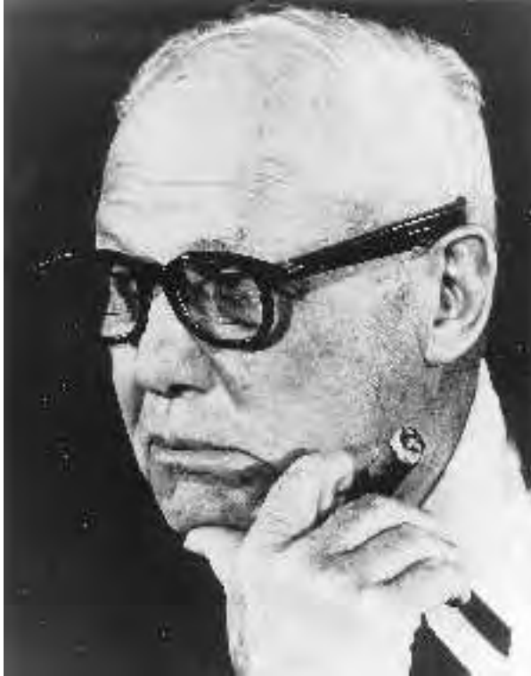
George Meany, the first president of the AFL-CIO and a symbol of the power and pragmatism of organized labor.

Packard and General Electric. Opportunity shone on entrepreneurs and skilled workers alike in a vast “Gunbelt” stretching from Seattle down through southern California and over to Texas. This was the civilian half of the military–industrial complex Eisenhower had warned about—and it was drawing population and federal money away from the old manufacturing hub in the East and Midwest.