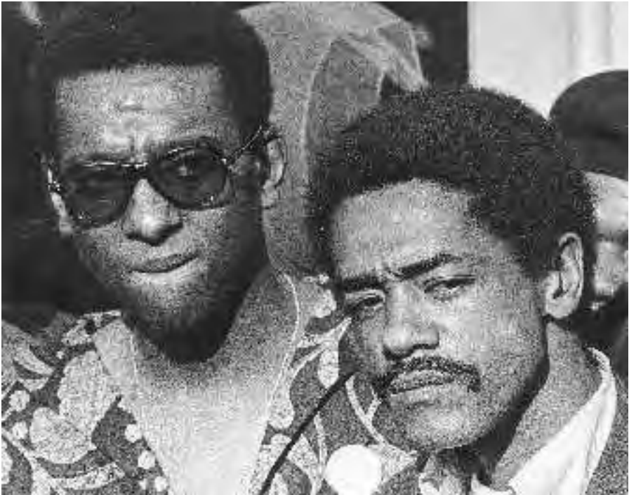
Stokely Carmichael of SNCC (left) and Bobby Seale of the Black Panther Party (right), prominent black revolutionaries, 1967.

After the summer of 1964, SNCC veterans began to turn against the principles of interracialism and integration that had guided them since the group's founding in 1960. During Freedom Summer, whites actually outnumbered blacks in SNCC's voter registration projects in Mississippi; as a result, the campaign attracted the fulsome attention of the national media, as well as the support of many prominent white politicians in the north. That had been foreseen by SNCC's leaders, and was in fact the point of inviting white volunteers to Mississippi in the first place. But the very success of the strategy prompted some SNCC leaders to ask why it required placing middle-class whites in harm's way to prick the national conscience. Where had all those television news cameramen been when only blacks were being beaten, incarcerated, and murdered in Mississippi? Stokely Carmichael concluded that depending on sympathetic whites for political cover was, in itself, a concession to racism. 19