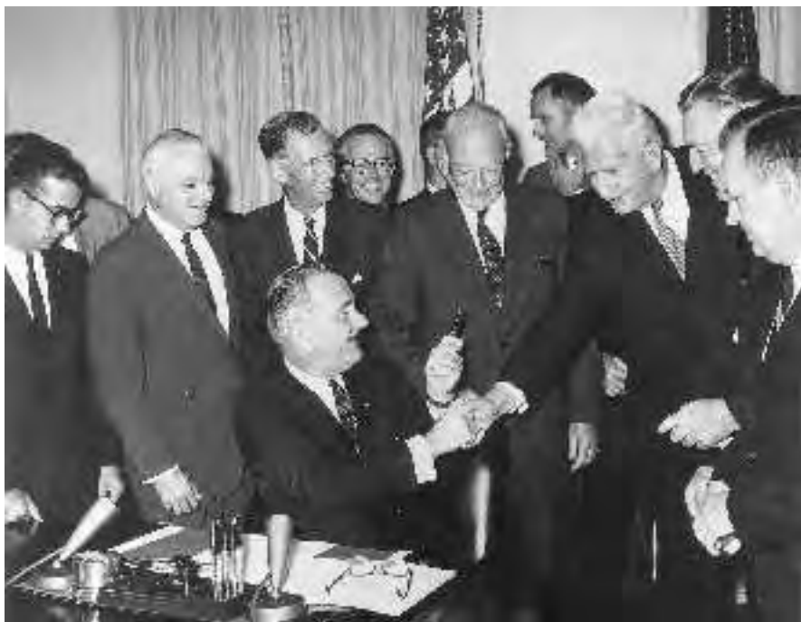
LBJ engaged in one of his favorite activities—signing a bill passed by the Democratic Congress. He is handing a pen to Senator Paul Douglas (D-Ill.).

It was a political gamble, but it seemed a reasonable one, until August 11, just five days after the signing of the Voting Rights Act, when rioting broke out in the black community of Watts in Los Angeles. Watts was a neighborhood of single-family detached houses that to many outsiders did not look like a “slum” at all. But it had all the problems of more congested urban neighborhoods, including poor schools, high unemployment, and a high crime rate that included a growing drug-abuse problem. When a white California highway patrol officer arrested a drunk black driver who resisted arrest, the incident sparked rumors in the black community that police had also, and without provocation, beaten a black taxi driver and a pregnant woman. Bands of teenagers, chanting “Burn, baby, burn!” began to throw stones at police, and at cars driven by whites. When the police failed to restore order that night, looting and arson followed. There was an air of desperation but also insurrectionary bravado in the disorders. “These fucking