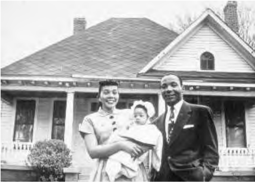
Dr. Martin Luther King Jr., Coretta Scott King, and their baby daughter in the 1950s.

But he was nominated to be leader of the MIA for less glorious reasons: as a newcomer in town, he had no enemies, and older ministers feared taking the post might weaken their positions and endanger their lives.