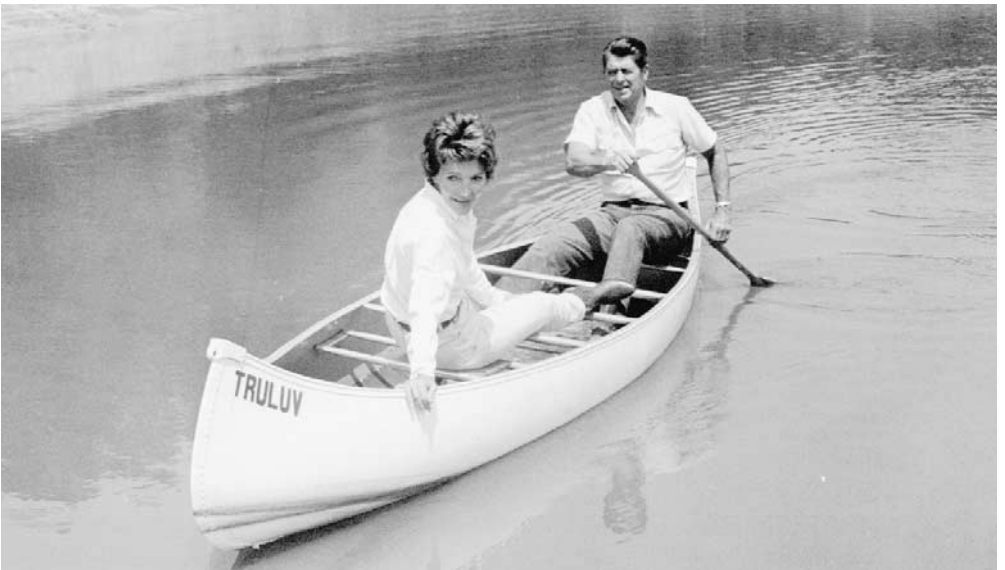
Nancy and Ronnie at Rancho del Cielo in the canoe he gave her as an anniversary gift, 1976.