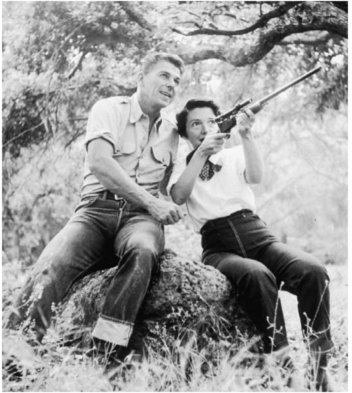
Ronnie and Nancy at their Malibu Canyon ranch, 1954.