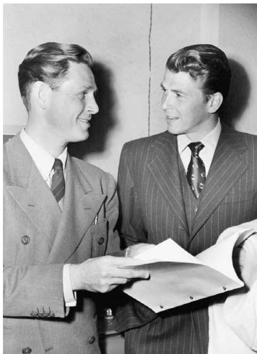
Ronald Reagan and his brother, Neil, at a Warner Bros. radio broadcast, 1943.