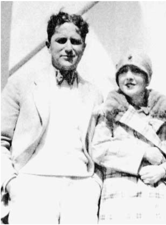
Dr. Loyal Davis and Edith Lockett on the SS New York in 1927, two years before their marriage.