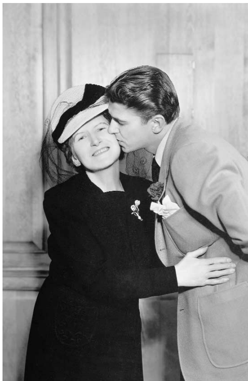
Nelle Reagan visiting her son Ronald on the set of Stallion Road , 1947.