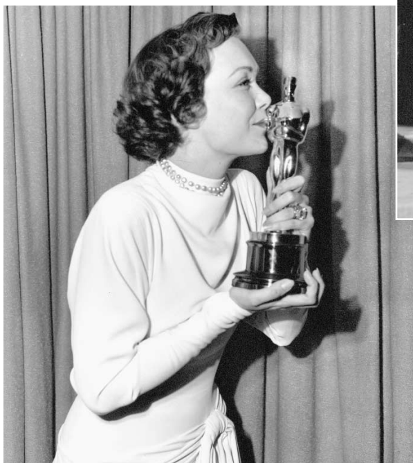
Wyman with her Academy Award for Johnny Belinda, March 1948.