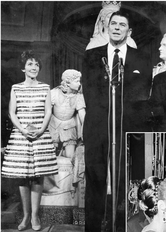
Nancy gazing at her husband after his swearing-in as governor in Sacramento, January 2, 1967.