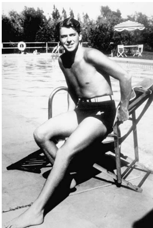
A publicity photo of Ronald Reagan shortly after his arrival in Hollywood in 1937.