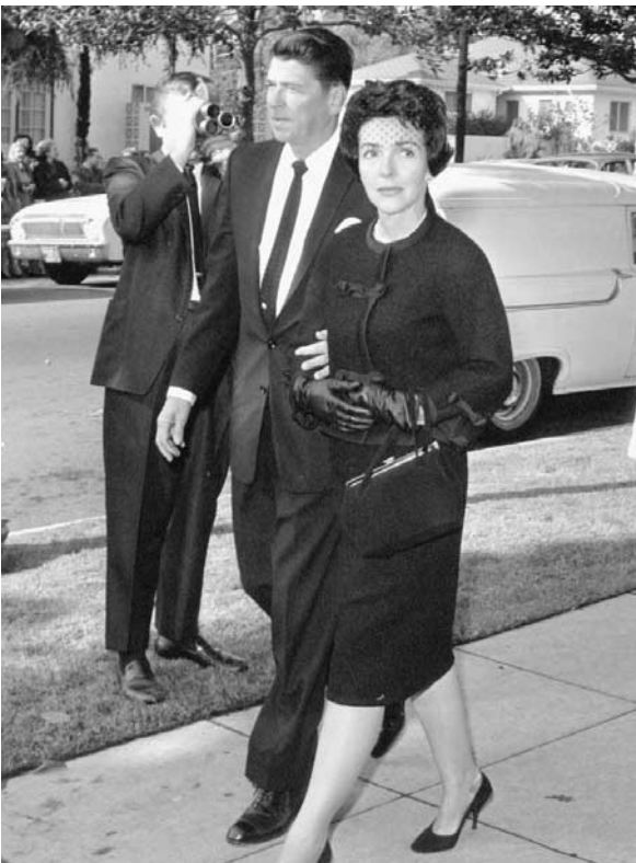
The Reagans arriving at the funeral of their close friend Dick Powell in Beverly Hills, 1963.