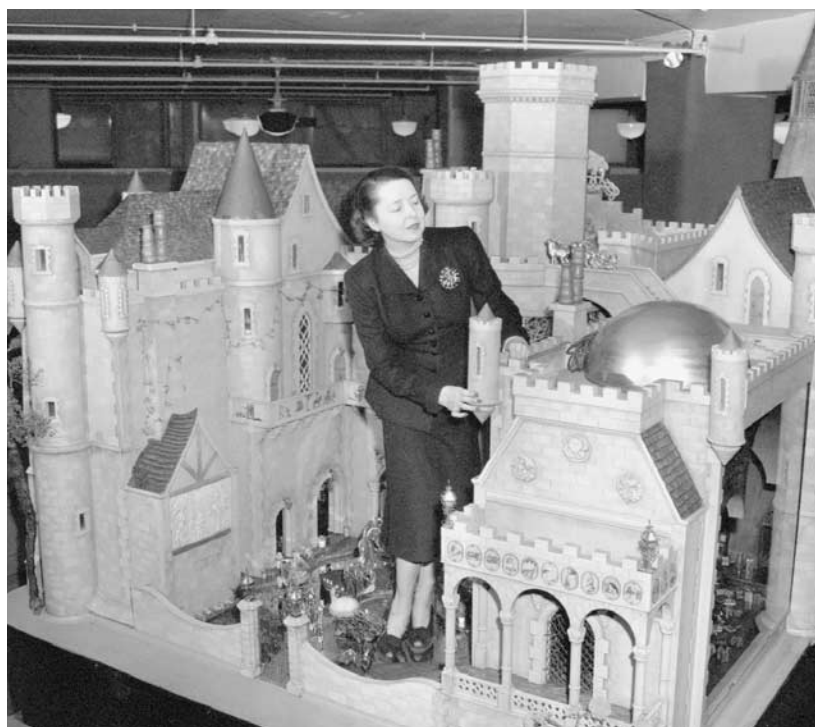
Colleen Moore Hargrave, the silent screen star turned Chicago socialite, with her famous Doll House.