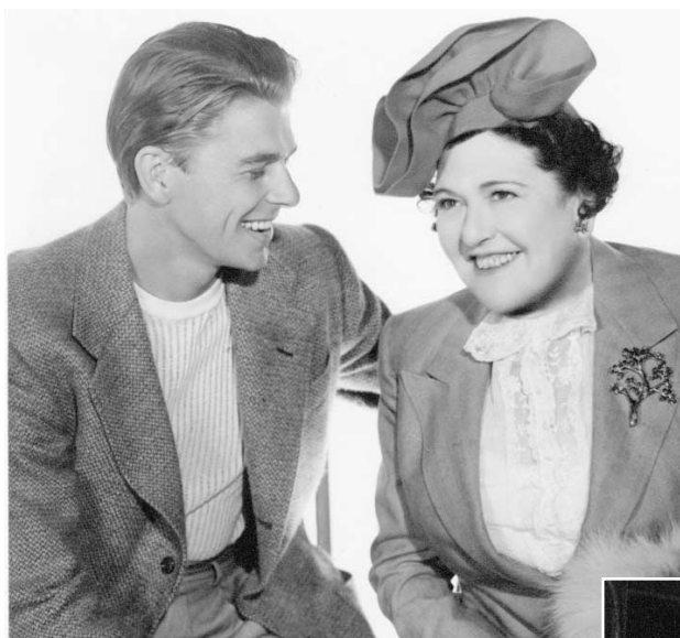
Reagan with gossip columnist Louella Parsons, who also hailed from Dixon, Illinois.