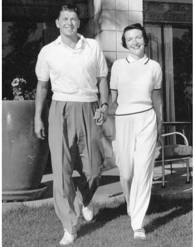
The newlyweds on their honeymoon at the Arizona Biltmore Hotel in Phoenix.