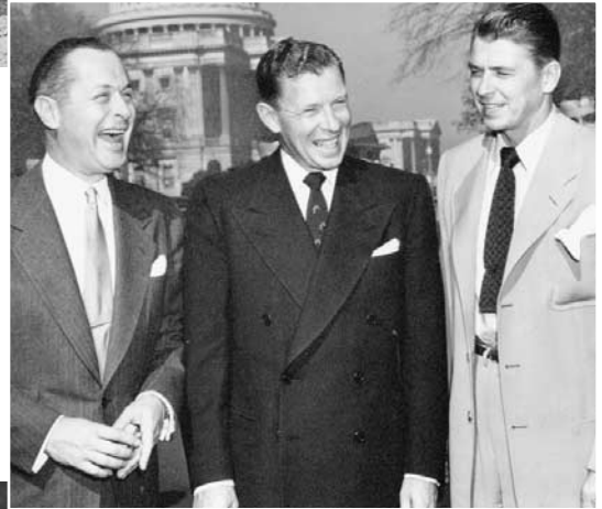
Screen Actors Guild leaders Robert Montgomery, George Murphy, and Ronald Reagan after testifying before HUAC, October 23, 1947.