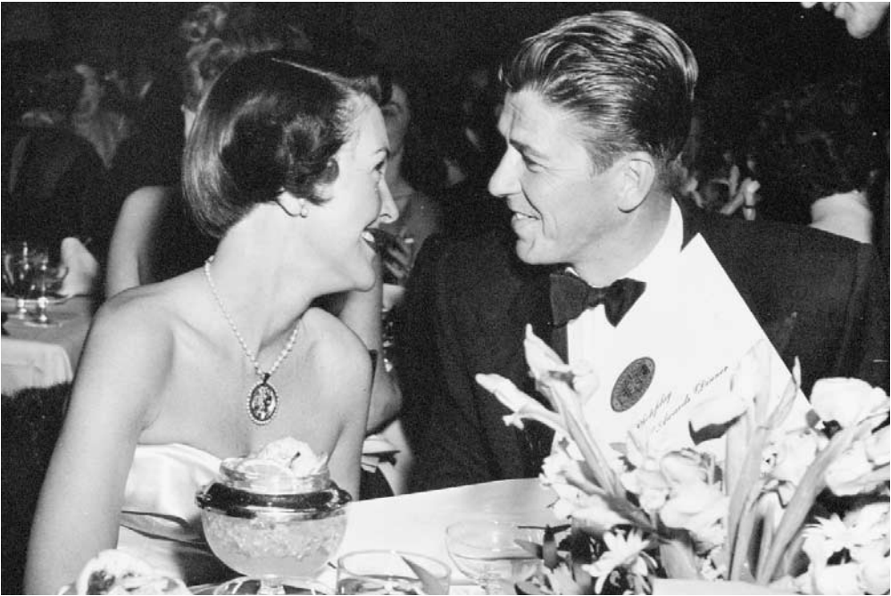
Nancy Davis and Ronald Reagan on a date at a Beverly Hills Hotel gala.