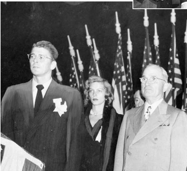
Reagan and Lauren Bacall with President Harry Truman during his 1948 campaign.