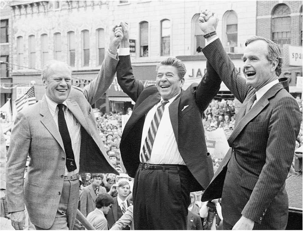
Ronald Reagan campaigning for president in 1980, flanked by former president Ford and Reagan's running mate, George H.W. Bush.