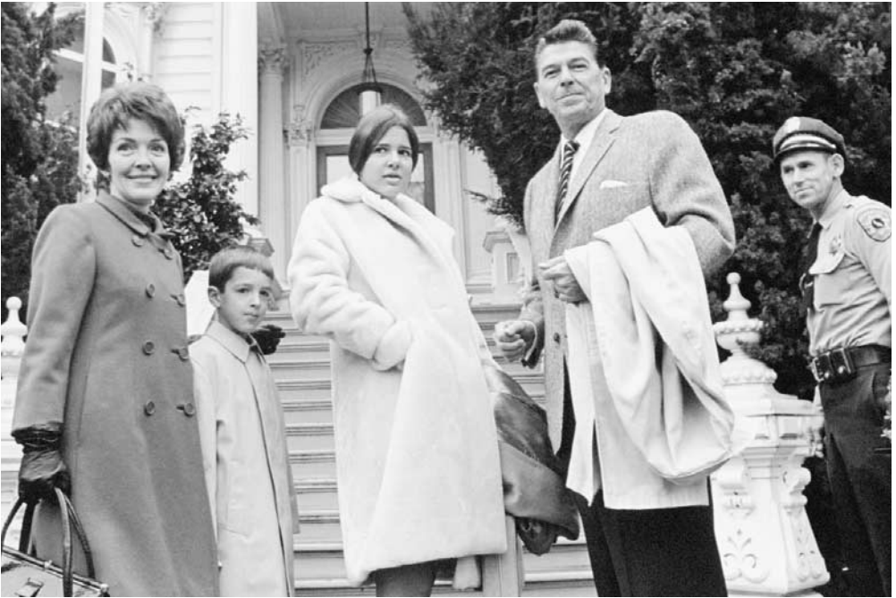
The Reagans with their children, Ron and Patti, moving into the old Governor's Mansion, January 1967.