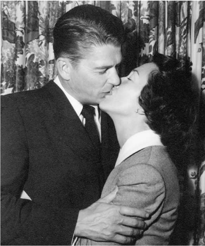
Ronnie and Nancy on their wedding day, March 4, 1952, photographed at the home of their witnesses, William and Ardis Holden.