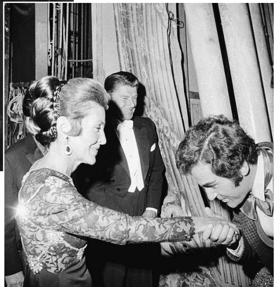
Governor and Mrs. Reagan backstage at the opening of the San Francisco Opera with tenor Franco Bonisolli, 1969.