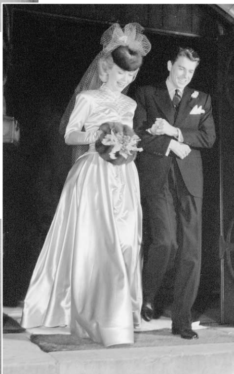
Jane Wyman and Ronald Reagan on their wedding day, January 26, 1940.