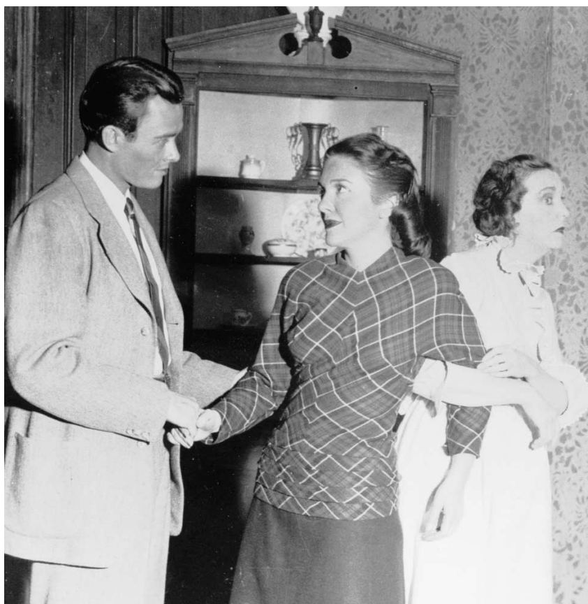
Nancy Davis onstage with ZaSu Pitts, a friend of her mother's and her theatrical mentor, circa 1946.