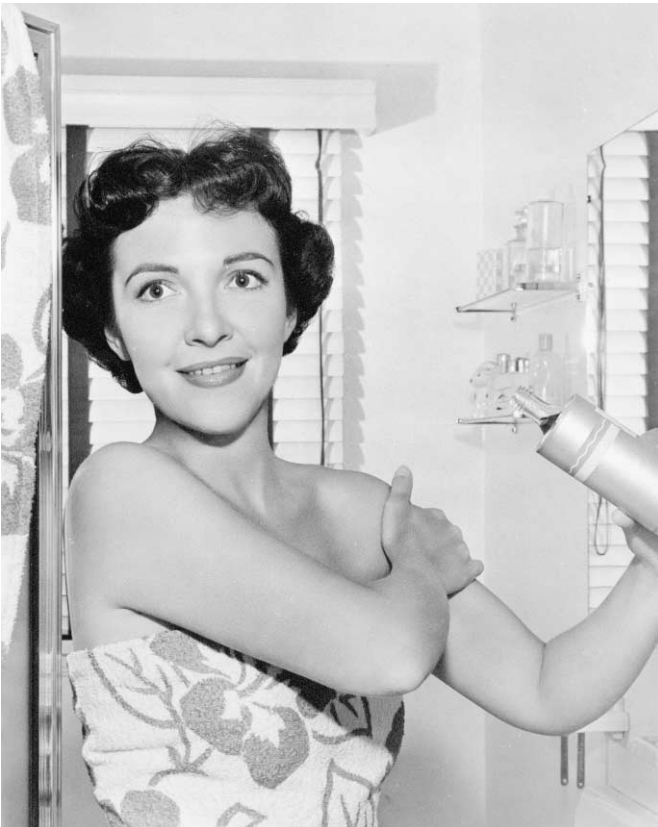
Nancy in a 1950 promotional photo for Metro-Goldwyn-Mayer.