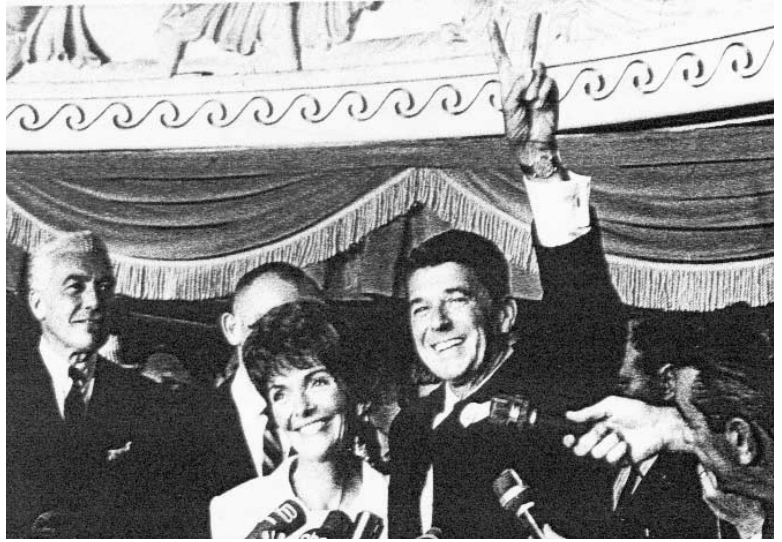
The Reagans celebrating his victory in the 1966 Republican primary for governor of California, with actor Cesar Romero.