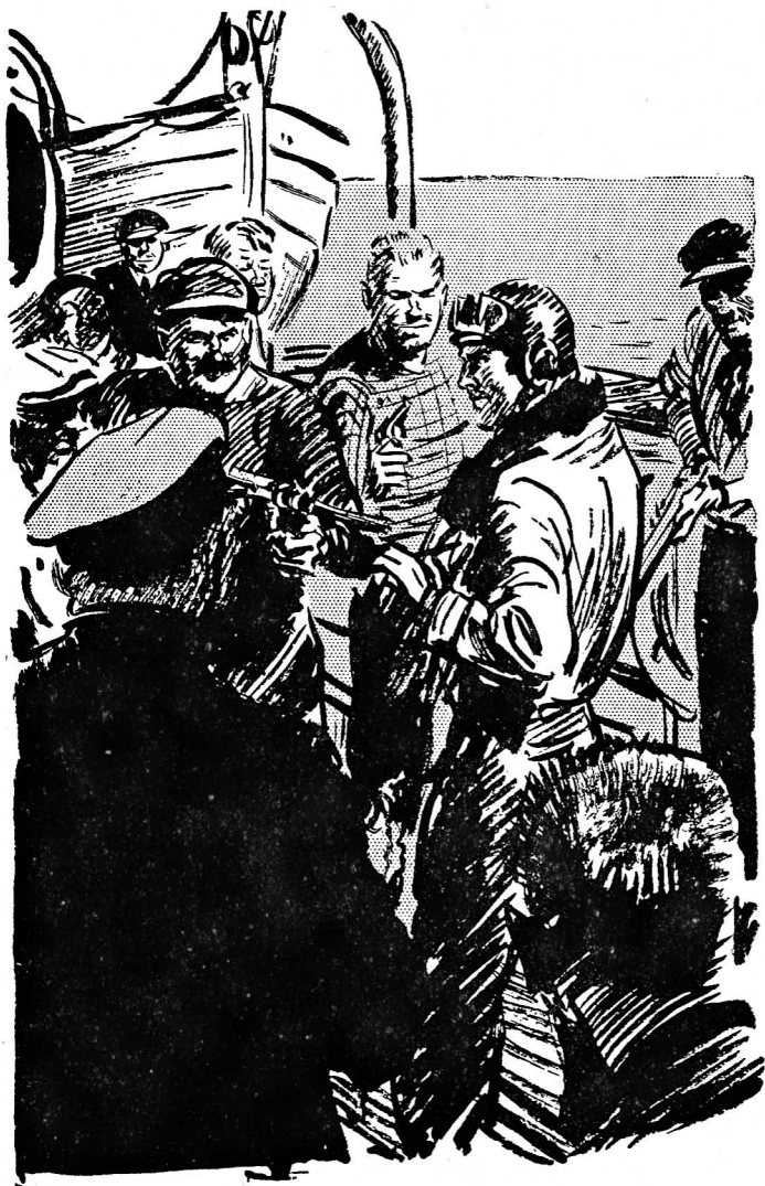
From all sides he was covered by a whole range of weapons