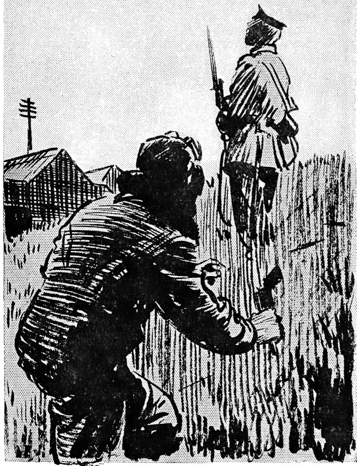
He was staring up into the sky when Biggles rose like a black shadow behind him