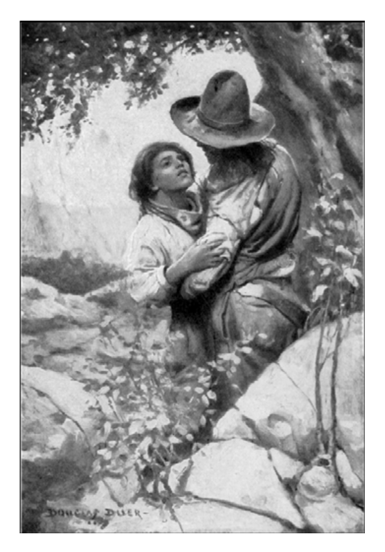
"Bess, I'll Not Go Again"