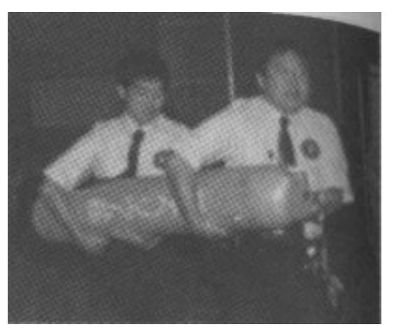
He moves around slowly with a helium tank.