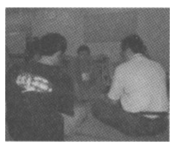
The day of the convention. A meeting is held to hammer out the remaining issues.