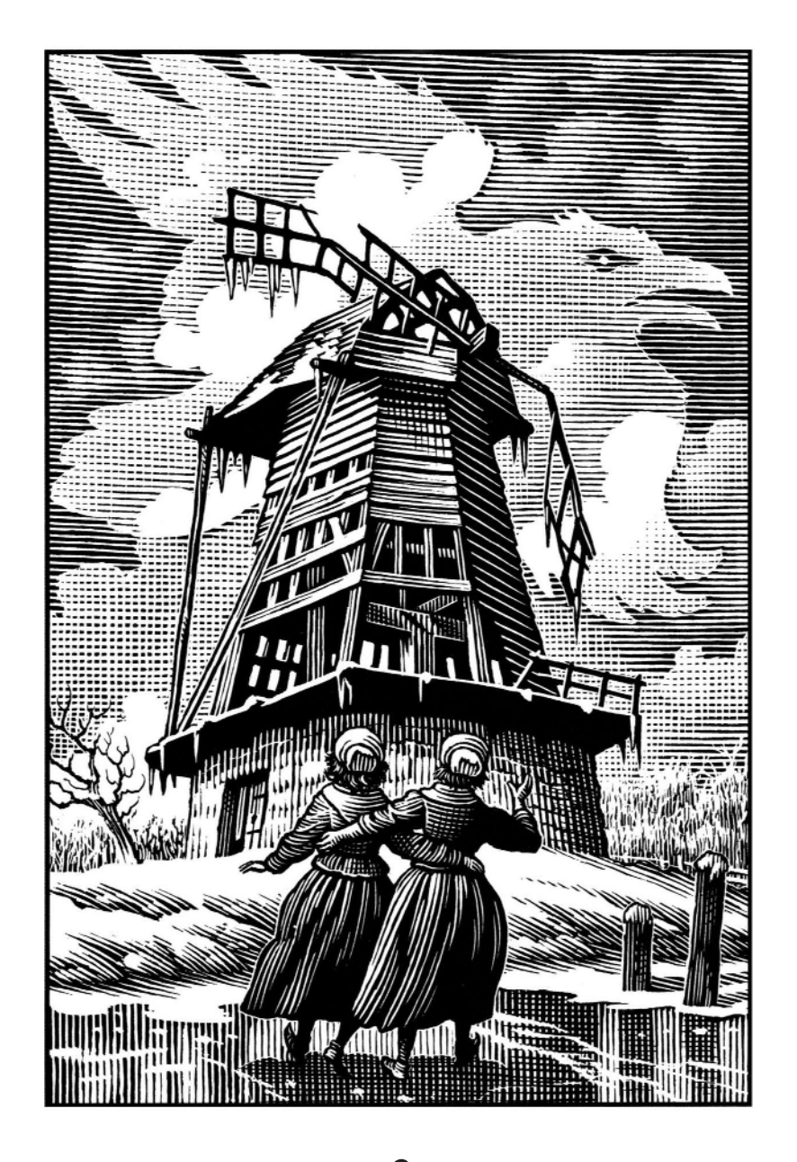
THE GIRL OF ASHES