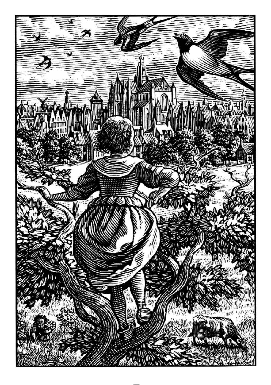
I THE OBSCURE CHILD