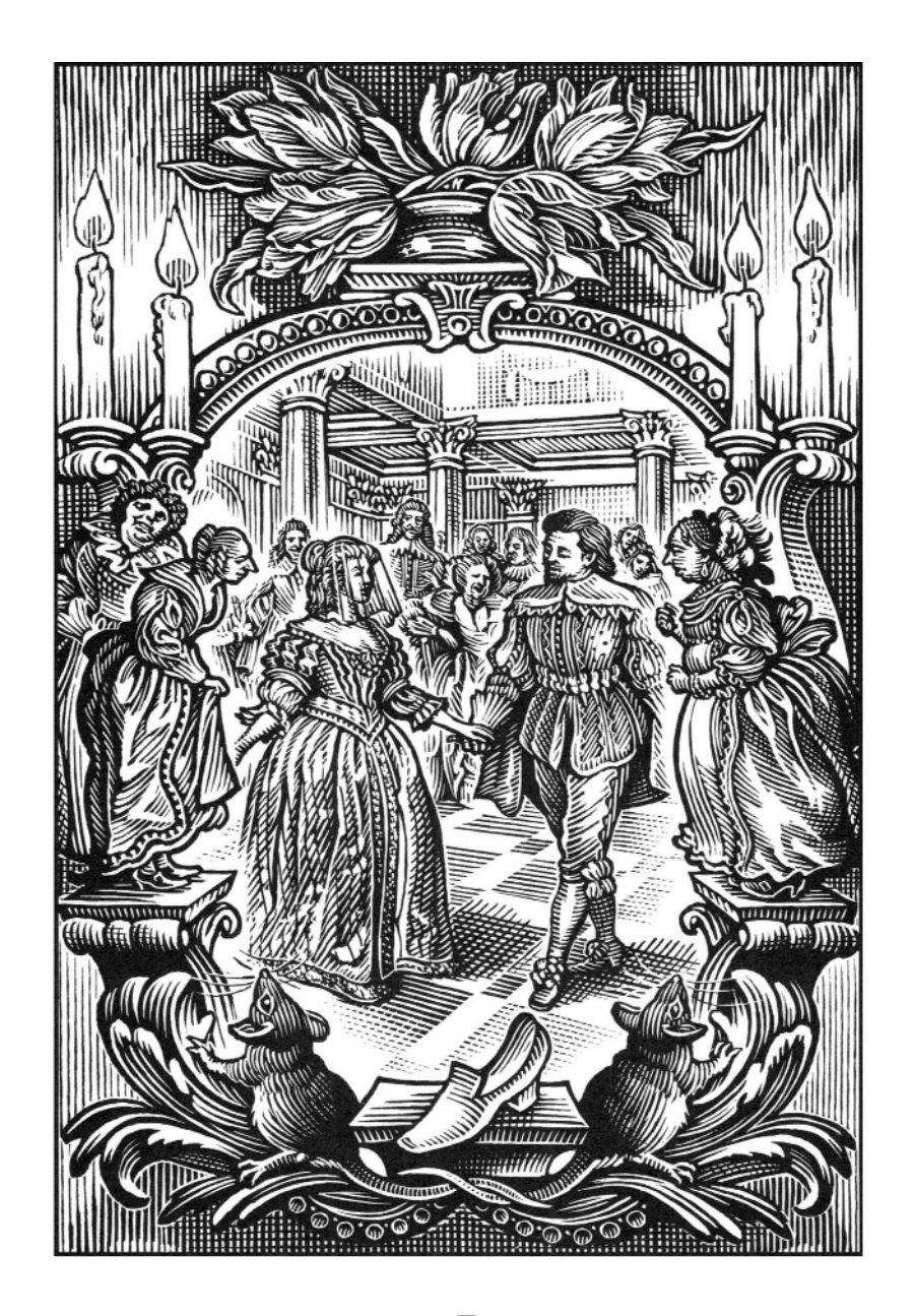
5 THE BALL