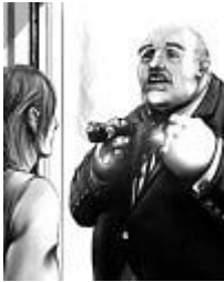
Big Otto's Casino