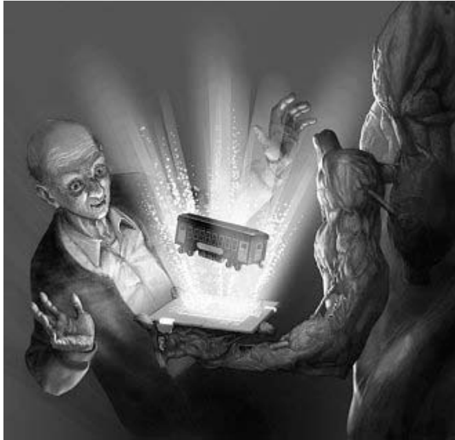
Artwork by Nick Greenwood

Three days later it happened again -- knock, knock, knock at Tom's front door, just as he was brushing glue over a papier-mâché hill.