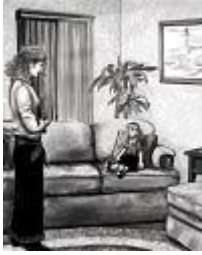
Just Like Me