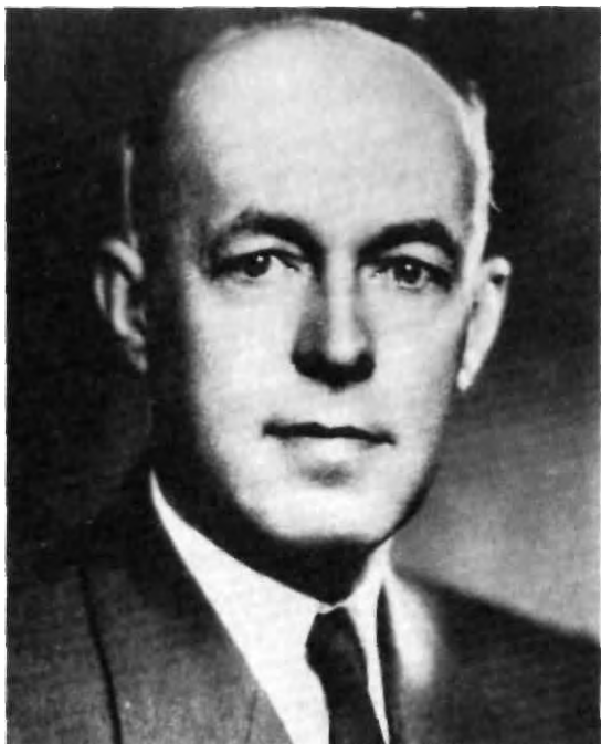
Herbert Yardley, the legendary American codebreaker whose Black Chamber was to dramatically affect the course of World War II in the Pacific.

in use, the more he was convinced that they were so simple as to make them useless for modern coded communications. Rebuffed by his superiors when he complained about the codes, Yardley decided on direct action to make his point: over a period of several months, he solved every single American code then in existence, and wrote up a report entitled Exposition on the Solution of American Diplomatic Codes . He concluded that European nations, known to have a first-class cryptographic ability, undoubtedly were reading the simple American codes with ease. He impolitically presented this report to his superior, who just happened to be the man who devised the codes in the first place. To further make his point, Yardley coolly walked into the man's office and opened his safe—whose combination, Yardley figured out, was based on the telephone number of President Woodrow Wilson's fiancée.