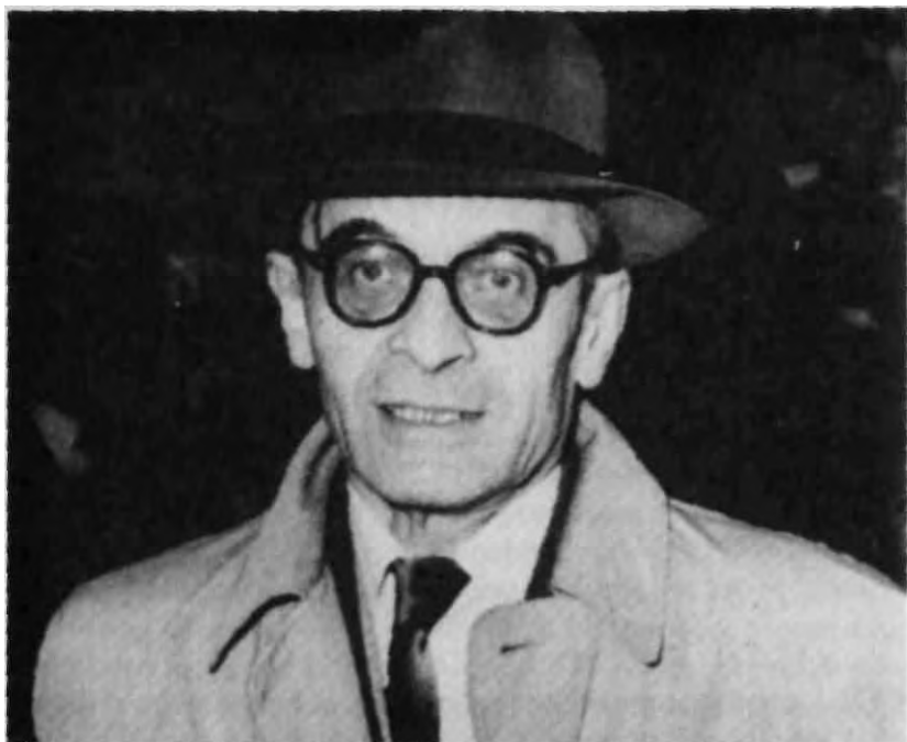
Rudolph Roessler (LUCY) arrives at a Swiss court in 1953 for his trial on espionage charges.

wasn't. It is this ambiguity that forms the core of the Roessler legend.