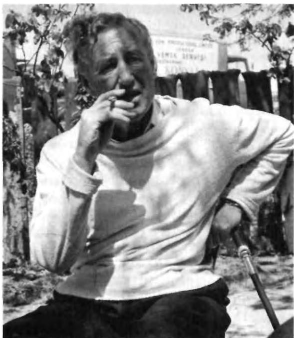
The "perpetual schoolboy," British agent Ian Fleming, whose World War II exploits paled beside his greater fame as the creator of James Bond.

proving brilliantly successful. Captured Germans, especially U-boat crews, recounted how the broadcasts were not only highly popular, but credible, too; when they heard about General so-and-so buying a mink coat for his mistress while his troops in Russia were freezing to death, they believed it. The station's effect on German military morale was devastating.