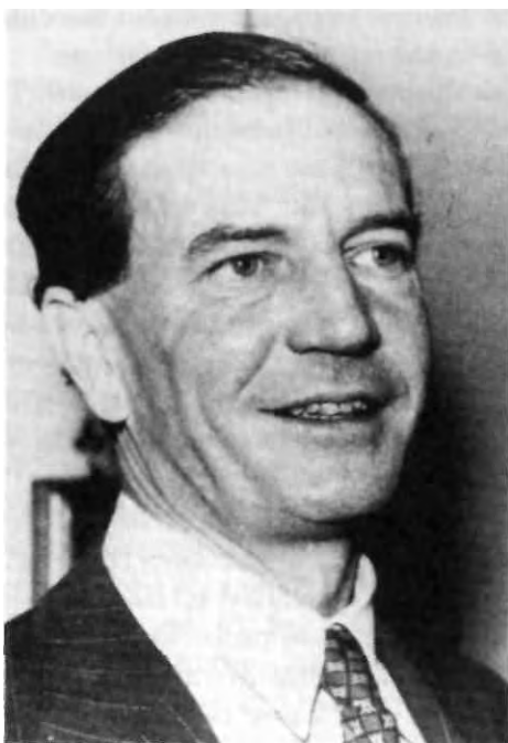
The quintessential mole: H. A. R. (Kim) Philby in 1955, when he was already under suspicion as a KGB agent who had infiltrated British intelligence.

a curious figure in British history, the Arabist H. St. John Philby. A full-blown eccentric, Philby senior made his name in the Middle East, where he worked on behalf of British intelligence to stir up Arab revolution against Turkey. After the war, convinced that Britain had betrayed the Arabs, he moved to Saudi Arabia, where he became a Moslem, took an Arabian woman as his second wife, and warned his son never to trust the word of the British establishment.