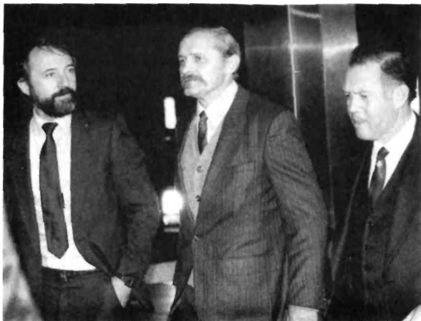
Vitaly Yurchenko, one of the KGB's brightest stars, entering the U.S. State Department after he defected to the U.S. for love of a woman.

agencies. In 1968, he expanded into foreign intelligence operations, and was assigned to Alexandria, Egypt, under cover of Soviet naval adviser to the Egyptian navy; his real job was to collect intelligence on the American Navy and other Western navies in the Mediterranean.