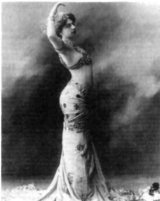
Margareta Zelle, in costume as the "Eye of Dawn" (Mata Hari).

spy; she remains the one instantly recognizable name in the public's mind when the subject turns to spies.