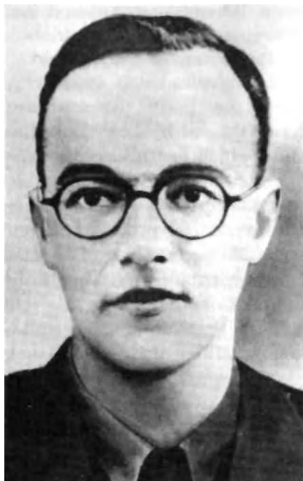
Klaus Fuchs, the German emigre nuclear physicist who betrayed the secrets of the atomic bomb to the Russians.