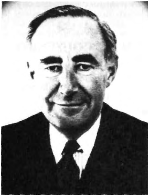
MI5 Director Roger Hollis, whose handling of Soviet defector Igor Gouzenko caused mole-hunters in British intelligence to suspect him of being a KGB mole.

overseas assignment, in June, 1943, following espionage schooling in Moscow. He had been a young army soldier in 1941, working in radio communications, when his brilliant abilities in handling cipher work brought him to the attention of GRU recruiters.