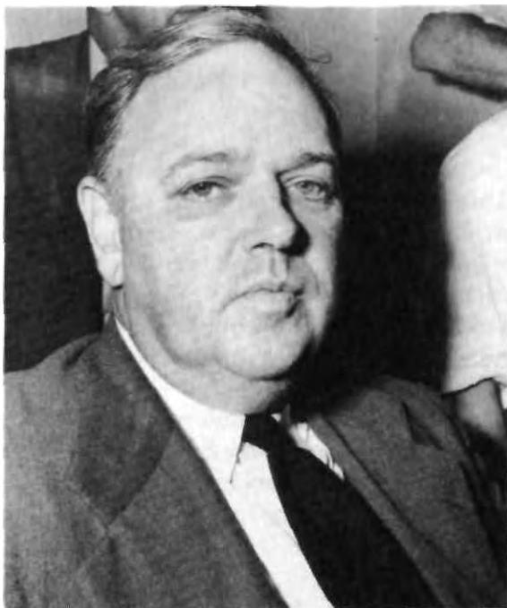
Whittaker Chambers, who set off the most explosive spy case in American history.

The FBI was puzzled by Chambers' reluctance to name names. Since he admitted to serving as a courier for Soviet rings operating inside the U.S. government, and thus obviously knew the identities of those assets, the FBI suspected he was protecting a close friend.