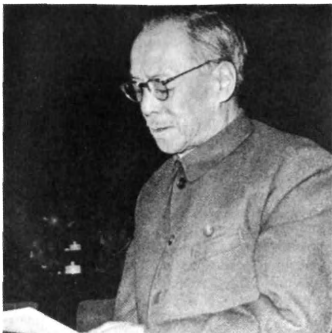
K'ang Sheng, Communist China's spymaster.

he came to the attention of party leaders by demonstrating a flair for espionage. He organized an informal spying operation to ferret out police spies from the party, an operation he extended to include spying on "dissidents" in the party who failed to demonstrate sufficient zeal in toeing the latest party line.