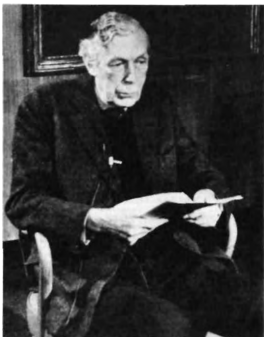
Anthony Blunt, a prominent art historian and art adviser to the Queen, in 1979 after his role as a Soviet spy was publicly revealed.

than Blunt could have imagined. There was an ugly edge to Blunt's role as a talent spotter: he often used sexual blackmail to keep new recruits in line, threatening to expose their homosexuality. In the days when homosexuality was a serious crime in Britain, this was no idle threat.