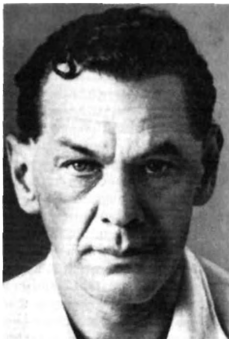
Soviet agent Richard Sorge, perhaps the greatest spy of all time, during his stay in Japan in 1940 under cover as a German journalist.

and although he would not tell her why, she sensed he was under some kind of intense pressure—so intense that he violated an elementary rule of tradecraft. It was a fatal error.