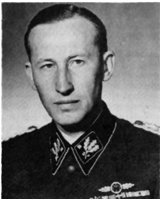
The sinister Reinhard Heydrich, called by Hitler "the man with an iron heart."

was organized—or, for that matter, did he know anything about intelligence. Nevertheless, drawing on his memories of spy movies and novels, he quickly sketched out how he thought a modern intelligence service ought to be organized. Himmler, who didn't know anything about intelligence either, was impressed; on the spot, he appointed Heydrich head of the new service, which he called the Sicherheitsdienst (SD).