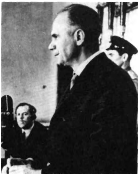
Colonel Oleg Penkovsky during his 1963 trial in Moscow on espionage charges after he was caught passing intelligence to the CIA and MI6.

Born 1919 in the Caucasus, the son of a mining engineer, Penkovsky entered the Red Army in 1939, and as a Communist party member with a clean record, was made a commissar. He fought in the Russo-Finnish war of 1940, then served during World War II in the artillery branch, suffering a severe wound in June 1944. Two years later, Penkovsky, regarded as one of the army's brighter officers, was recruited for the GRU. By 1955, he was the GRU's resident in Ankara, Turkey, under cover as military attache.