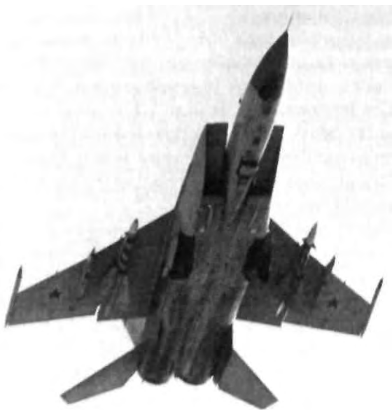
A Soviet MIG-25 in a training sortie. Vladimir Vetrov of the KGB, a mole working for French intelligence, revealed that its technology was the result of a top-priority KGB effort to steal Western military innovations.

panicked; apparently assuming that the KGB man was about to arrest him, he pulled out a knife and stabbed him to death. When the KGB secretary bolted from the scene, Vetrov tracked her down and stabbed her repeatedly. Assuming she was dead, he left, but returned an hour later to make certain.