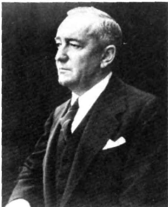
One of the few existing photographs of William Stephenson.

had been assigned a dual mission: first, a traditional intelligence function, to keep an eye on German intelligence operations in the United States; second, he was to work as a covert action specialist with the objective of getting the United States into the war by any means, fair or foul. It was to this second mission that Stephenson was to devote most of his time and energy.