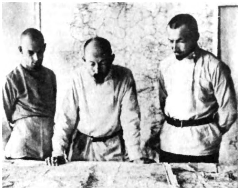
Feliks Dzerzhinsky (center) strategizing over a map during the October Revolution.

He moved with decisive swiftness. He had all the Okhrana officers he could find rounded up and offered a role with the Bolsheviks, under pain of death or imprisonment. From the Bolshevik power base in St. Petersburg, he seized all communications, including the post, telegraph, telephone, and even messengers. All "non-Bolsheviks" were banned from using any of these communications, so when Lenin carried out his coup, many members of the Kerensky administration did not know what was happening until it was too late. The communications blackout also served to paralyze Lenin's other opponents; by the time they tried to mobilize a counter coup, the Bolsheviks already had seized the reins of power.