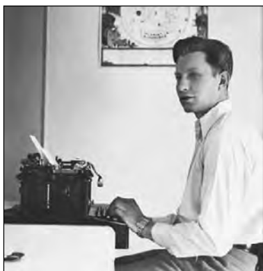
L. Ron Hubbard, circa 1930, at the outset of a literary career that would finally span half a century.

list included: Rene Lafayette, Captain Charles Gordon, Lt. Scott Morgan and the notorious Kurt von Rachen—supposedly on the lam for a murder rap, while hammering out two-fisted prose in Argentina. The point: While L. Ron Hubbard as Ken Martin spun stories of Southeast Asian intrigue, LRH as Barry Randolph authored tales of