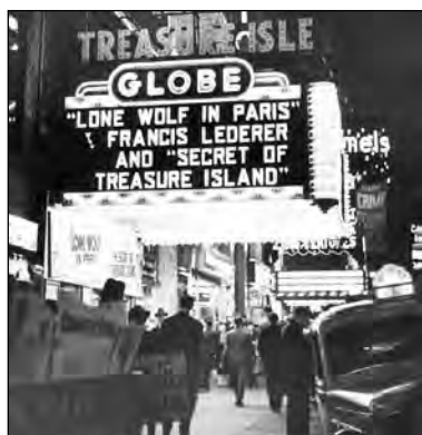
The 1937 Secret of Treasure Island, a fifteen-episode serial adapted for the screen by L. Ron Hubbard from his novel, Murder at Pirate Castle.

to rewrite/doctor scripts—most famously for long-time friend and fellow adventurer Clark Gable.