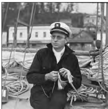
Capt. L. Ron Hubbard in Ketchikan, Alaska, 1940, on his Alaskan Radio Experimental Expedition, the first of three voyages conducted under the Explorers Club flag.

To which one might add: His earliest submissions date from the summer of 1934, and included tales drawn from true-to-life Asian adventures, with characters roughly modeled on British/American intelligence operatives he had known in Shanghai. His early Westerns were similarly peppered with details drawn from personal experience. Although therein lay a first hard lesson from the often cruel world of the pulps. His first Westerns were soundly rejected as lacking the authenticity of a Max Brand yarn