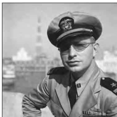
Portland, Oregon, 1943; L. Ron Hubbard, captain of the US Navy subchaser PC 815.

At least as influential in terms of post-apocalypse stories was L. Ron Hubbard's 1940 Final Blackout . Generally acclaimed as the finest anti-war novel of the decade and among the ten best works of the genre ever authored—here, too, was a tale that would live on in ways few other writers imagined.