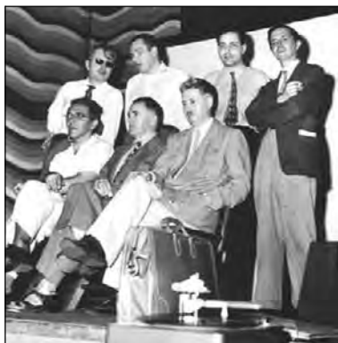
L. Ron Hubbard, 1948, among fellow science fiction luminaries at the World Science Fiction Convention in Toronto.

And, indeed, at J. W. Campbell Jr.'s insistence, Ron was regularly drawing on themes from the Arabian Nights and