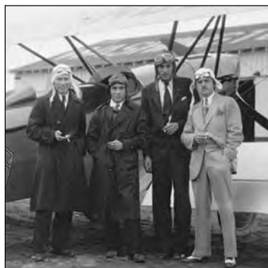
L. Ron Hubbard, left, at Congressional Airport, Washington, DC, 1931, with members of George Washington University flying club.

for North China, and the last in the line of Royal Magicians from the court of Kublai Khan. For the record, L. Ron Hubbard was also among the first Westerners to gain admittance to forbidden Tibetan monasteries below Manchuria, and his photographs of China's Great Wall long graced American geography texts.