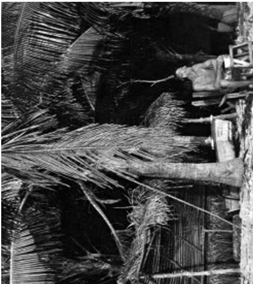
Relaxing on the beach in the warm glow of the evening