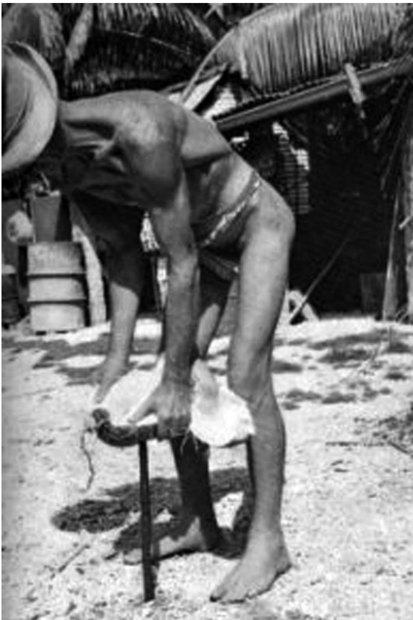
Husking a coconut the island way!