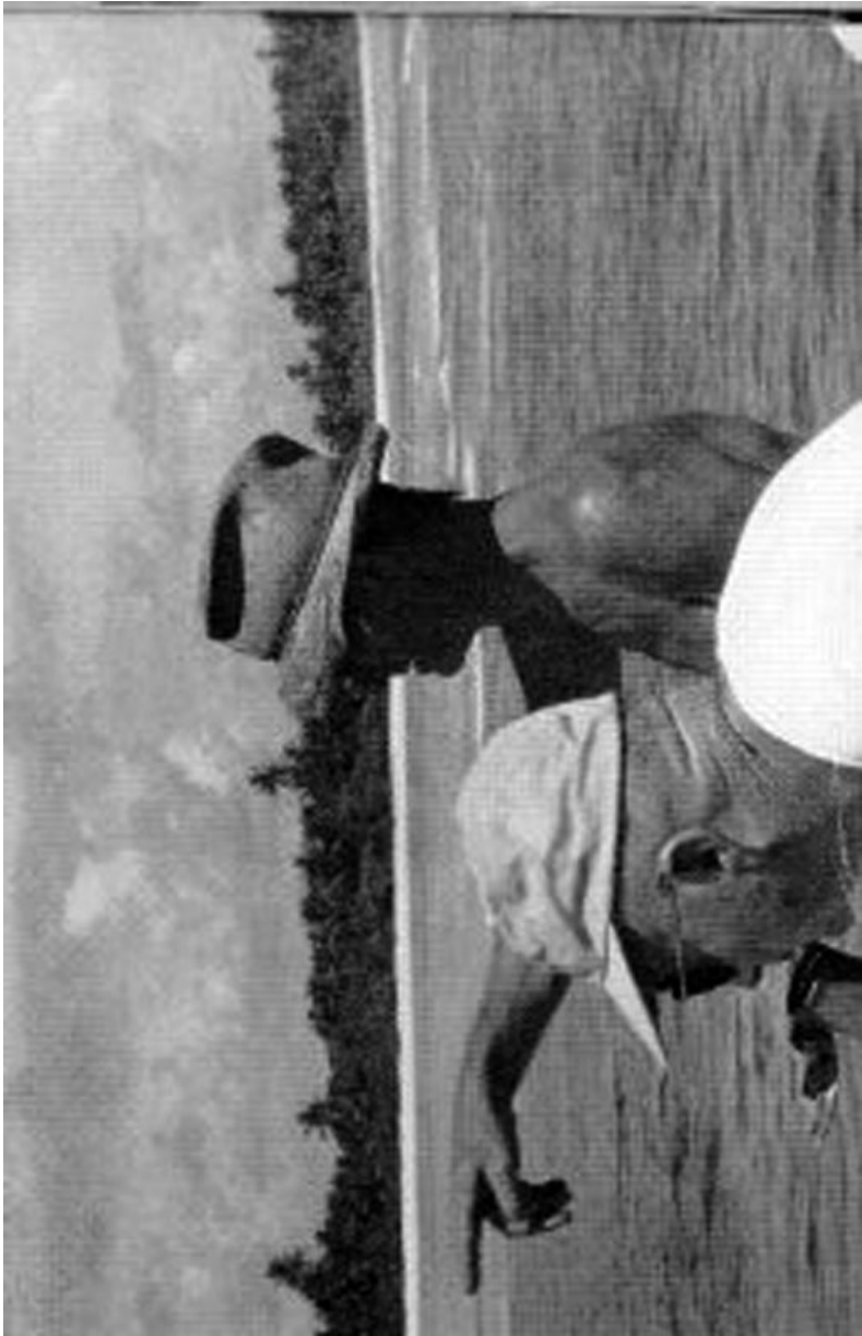
A view of Anchorage taken after I had rowed out to guide the skipper of a visiting schooner through the pass.