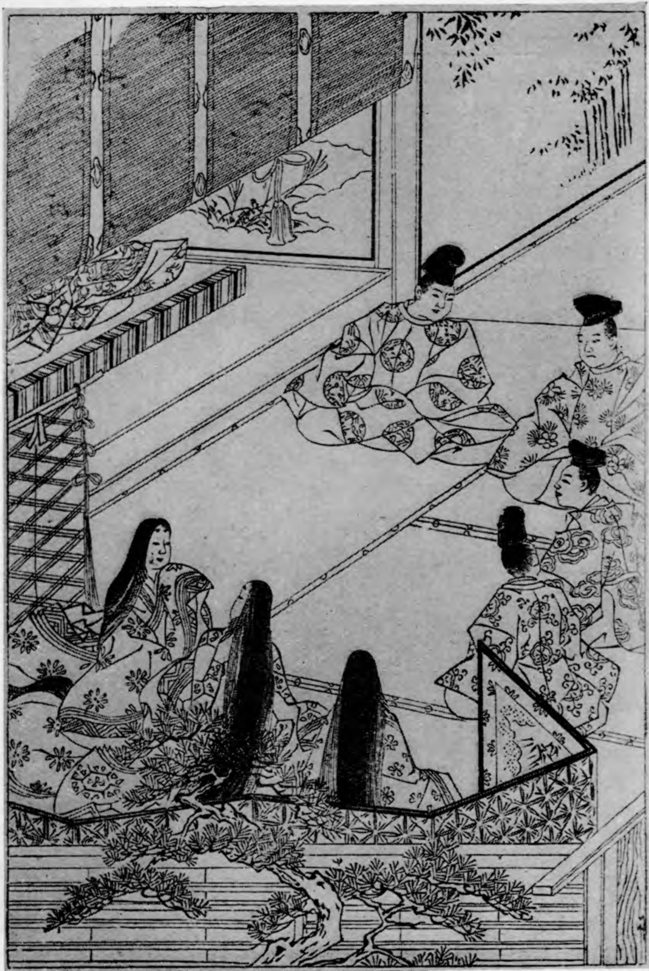
They met in the Royal Presence.