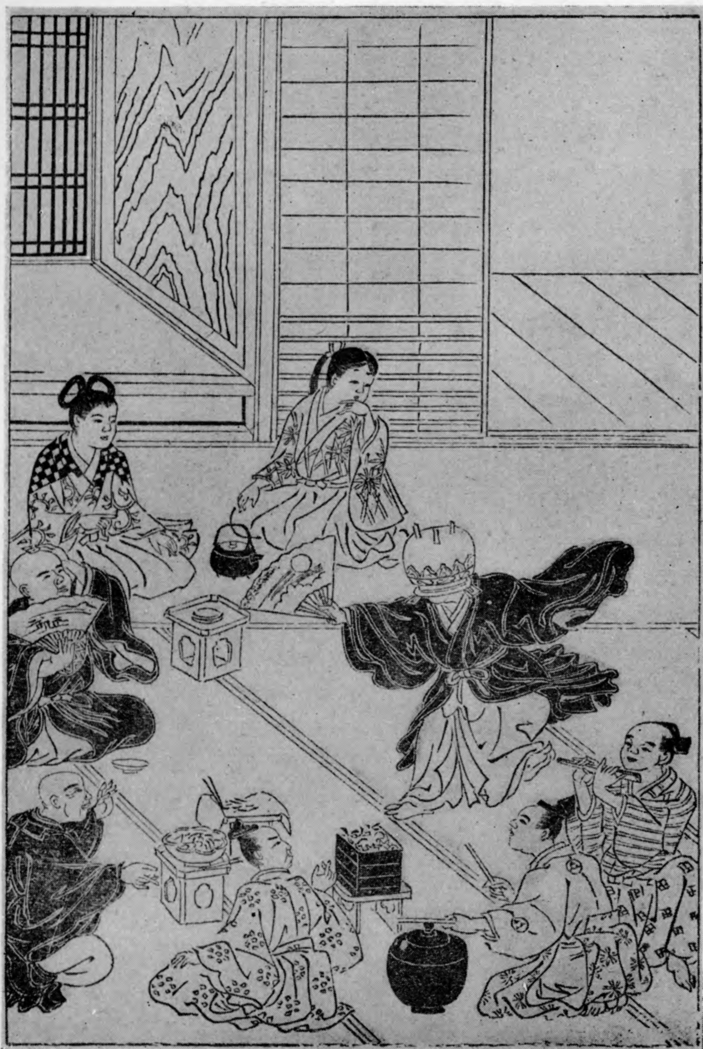
(The boy) in an excess of jollity seized a three-legged pot which was standing near, put it on his head, . . . and began to dance.