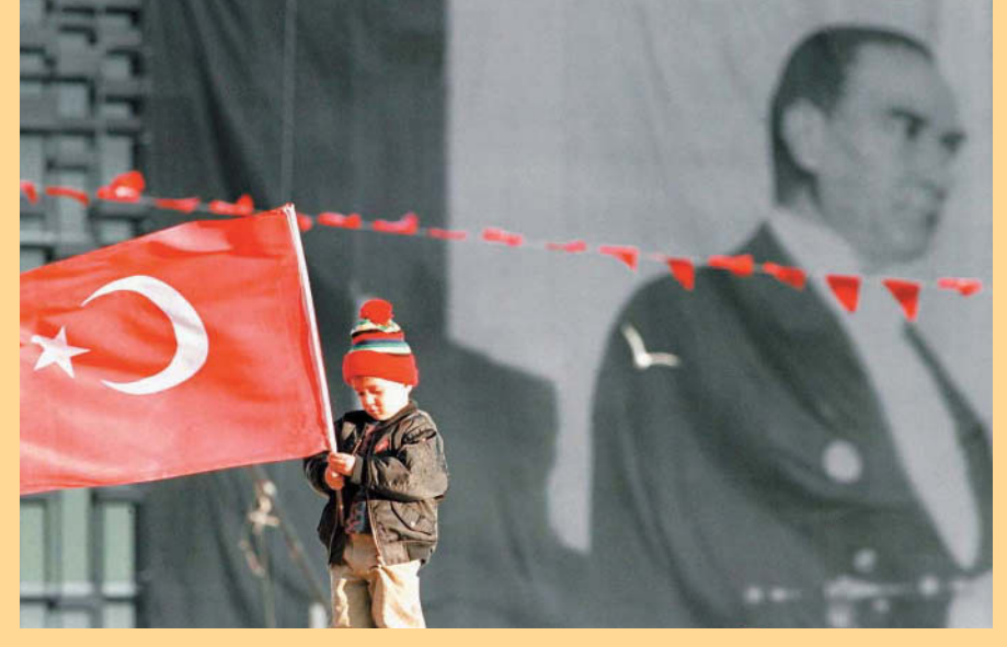
A boy carries a Turkish flag to celebrate a holiday proclaimed by Atatürk (right).

in Turkey, including replacing Arabic script with the Latin alphabet, introducing a Western-style legal system, and ending religious education in Turkish schools.