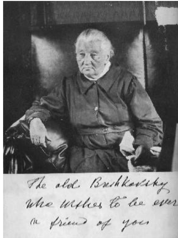
KATHERINE BRESHKOVSKY GRANDMOTHER OF THE REVOLUTION