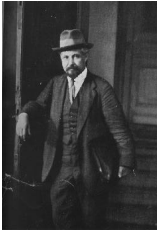
TCHERNOFF CHAIRMAN OF THE CONSTITUENT ASSEMBLY

Victor Tchernoff, once so powerful with the peasants but discredited because he stood for coalition at the Democratic Congress, was elected President. Whenever he spoke he was hissed and booed by the left. Tseretelli was the only Constituent Assembly member listened to by both sides with respect. Tseretelli is a great man, the finest of all the moderate socialist party leaders. Why Kerensky and not Tseretelli was made head of the nation under the Provisional Government I could never understand. Tseretelli towers above Kerensky as Lincoln does over Buchanan or Cleveland. But middle parties and their leaders can never stand in time of revolution and Tseretelli went down with all the rest.