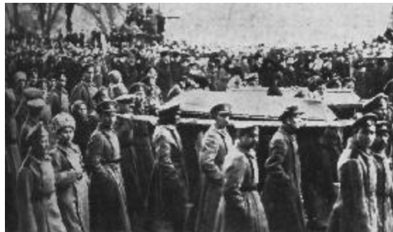
THE RED BURIAL HELD IN MOSCOW IN NOVEMBER. FIVE HUNDRED BODIES WERE BURIED IN ONE DAY.

General Semionov was only recently chased out of Siberia, his men killing their officers and going over to the Bolsheviki. The backbone of the Cossack movement seems to be broken.