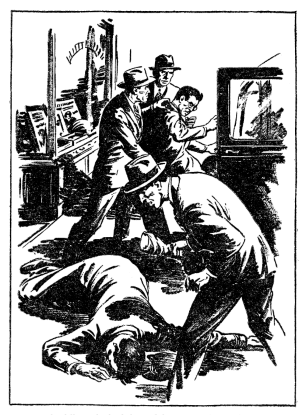
The fellow who had slugged the cop was last in the car.

The ride ended at a brownstone house in a once fairly swanky section of the east Thirties, a house which had a basement garage into which they drove. The door was guickly closed behind the car.