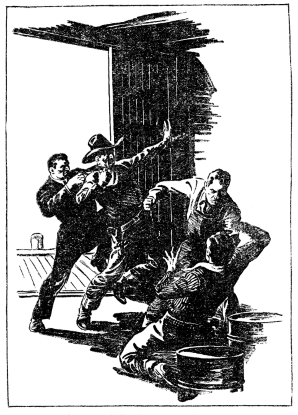
They were old hands at commando tactics, and the battle was very quickly finished.

In fact they didn't discover him until he spoke to them.