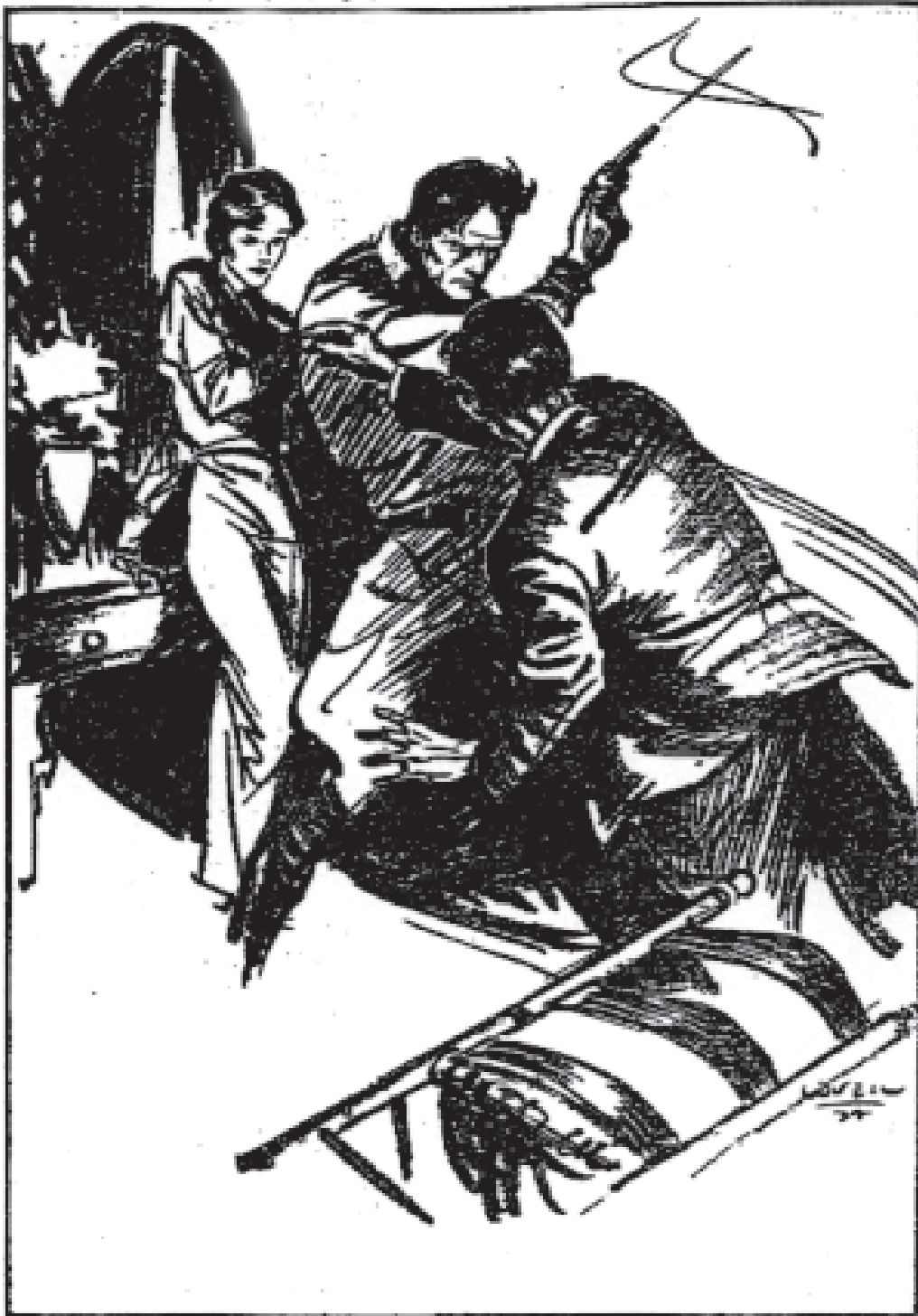
Twindell struck Rokesbury's arm just as the engineer fired.