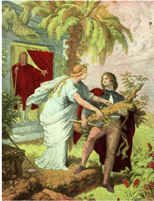
Ferdinand and Miranda

So the four mortal lovers went back to Athens and were married; and the fairy King and Queen live happily together in that very wood at this very day.