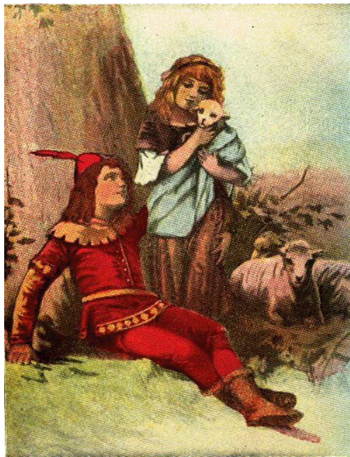
Prince Florizel and Perdita

The wedding was a merry one, in the mossy glades of the forest. A shepherd and shepherdess who had been friends with Rosalind, when she was herself disguised as a shepherd, were married on the same day, and all with such pretty feastings and merrymakings as could be nowhere within four walls, but only in the beautiful green wood.