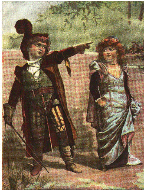
Petruchio and Katherine