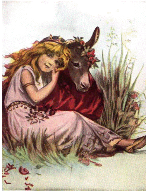
TITANIA AND THE CLOWN