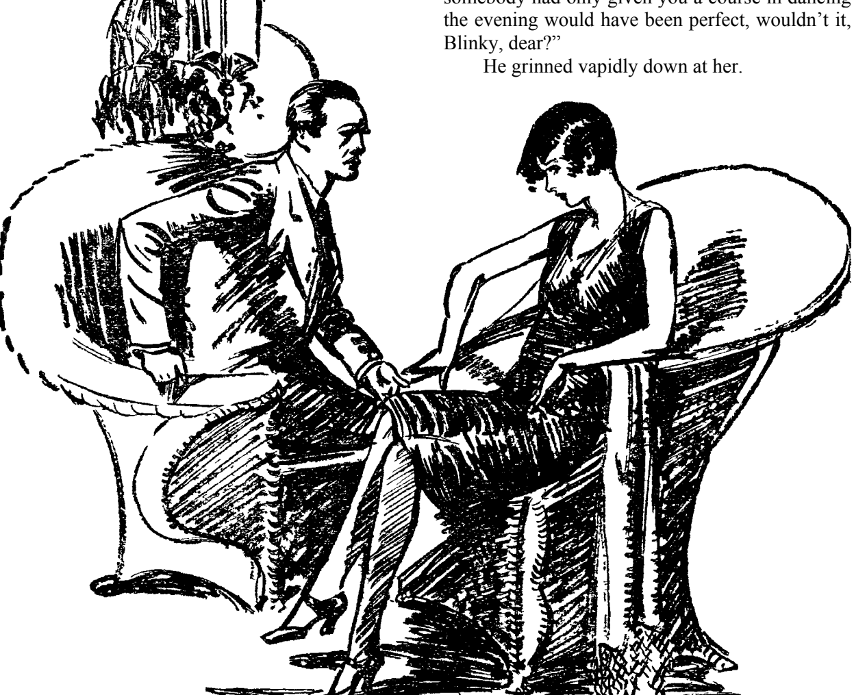
"As long as I live, I'll remember tonight," said Cricket softly. "I'll never stand on my hands and point my feet at the sky again. I'll be ever so sensible, Hal, because you want me to be!"

"Nifty," Cricket replied, trying to keep him from tramping on her silken ankles. "Now if somebody had only given you a course in dancing the evening would have been perfect, wouldn't it, Blinky, dear?"