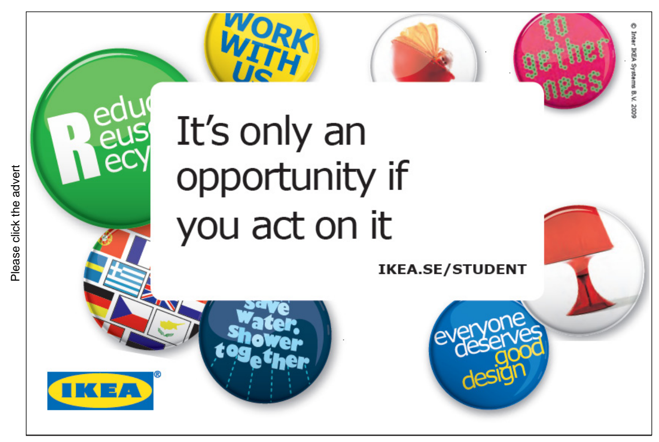
Download free ebooks at bookboon.com

Industrialisation, with its revolutionary effects on the way of life in the major countries, was under way in the period of interest in this first part of the essay. The next part will deal with the period between 1810 and the availability of oil in circa 1870. The author sometimes sees this period as the 'dark ages' in fuel and energy matters and will attempt to throw a little light on them!