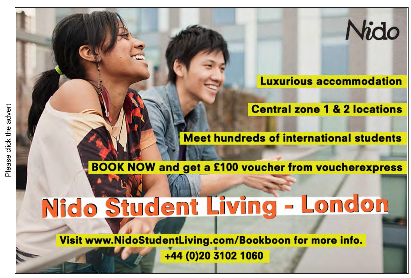
Download free ebooks at bookboon.com

Toyota<sup>x</sup> and Nissan cars became available at about the time of WW1, fuel for them being imported largely from the then Dutch East Indies. Coal production was on a large scale in countries including the UK, the USA, Germany, China and Japan.