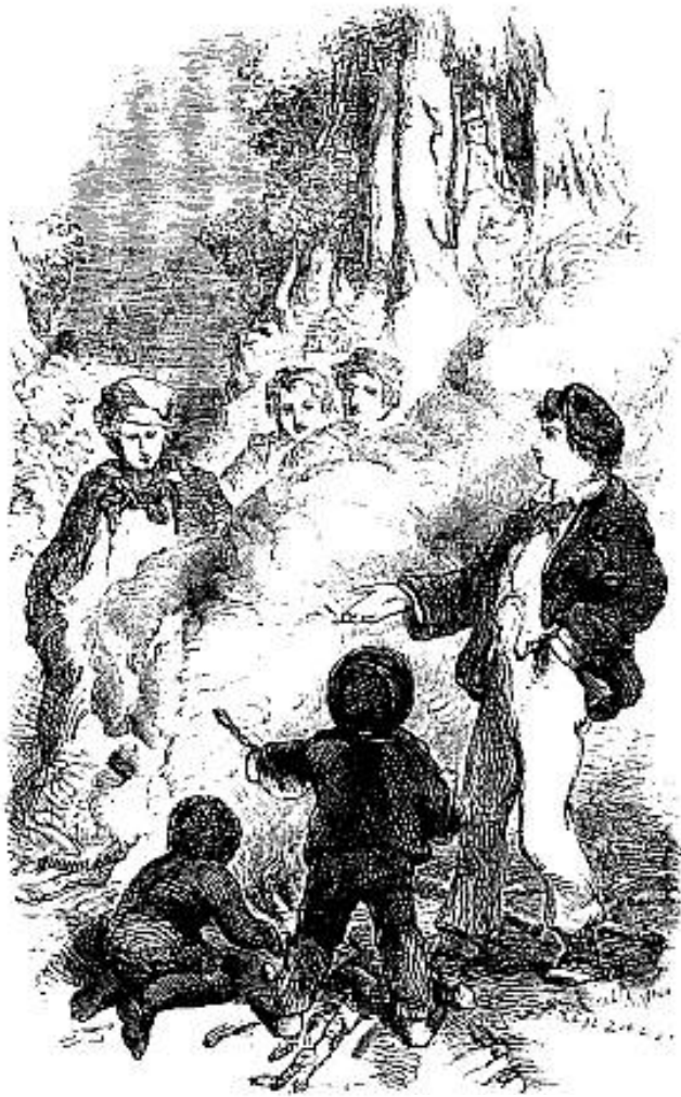
The Island Breakfast.

Morton and Browne at this moment emerged from their respective heaps of leaves, and, after rather more than the usual amount of yawning and stretching of limbs, came towards the fire.