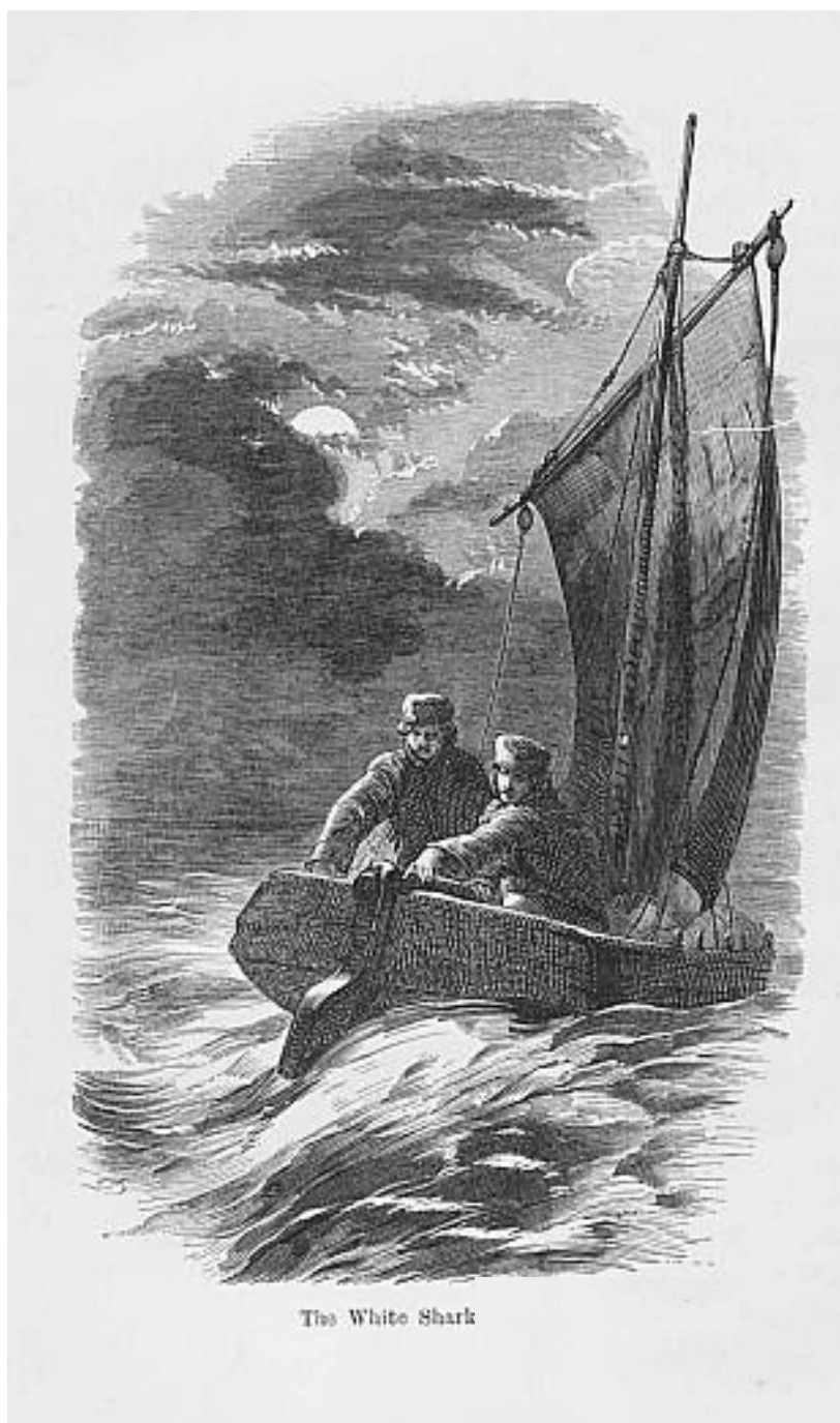
The White Shark