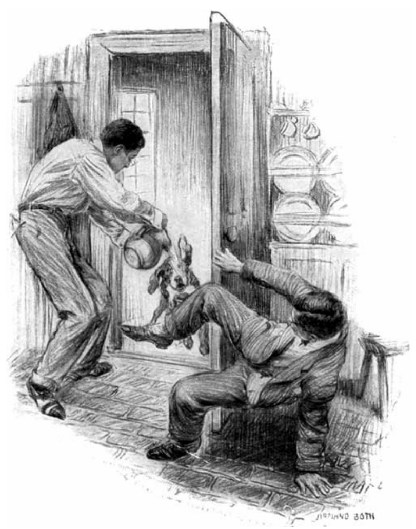
They had a momentary vision of an excited dog, framed in the doorway.

Over a cup of tea Ukridge became the man of business.