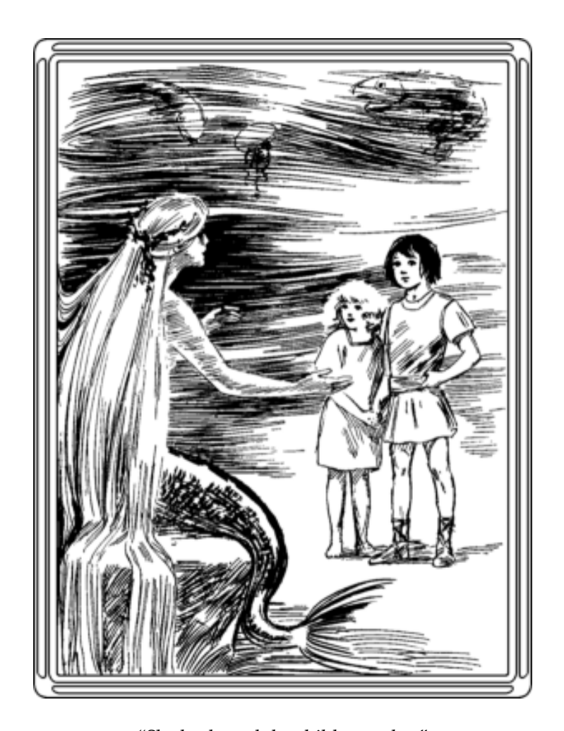
"She beckoned the children to her"