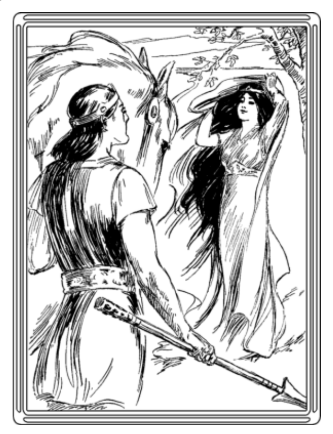
"Standing before him was the little princess"

At last the knight reached the little hut. Three times he struck the shield with the haft and three times with the blade of his spear. At the last blow the hut disappeared, and standing before him was the little princess.