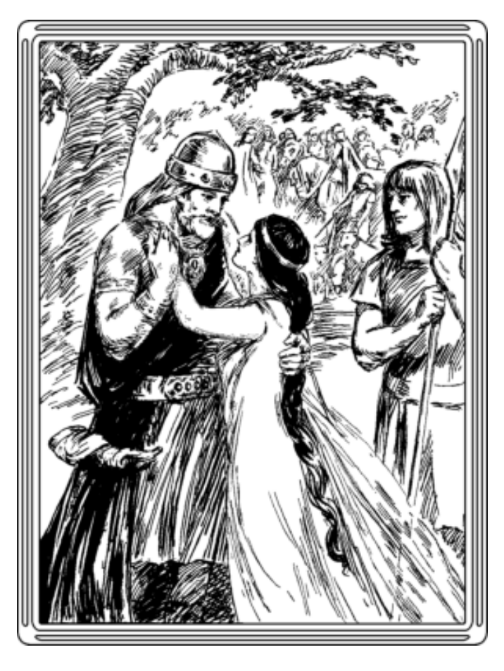
"'I have mourned you as dead, my darling,' said he"

Enda took out the spear, and then pushed the boat from the bank. It sped on towards the hut in the middle of the lake; but before it had reached halfway six nymphs sprang up from the water and seizing the helmet and dress, sank with them beneath the tide, and the boat went on until it pushed its prow against the steps of the little hut, where it remained.