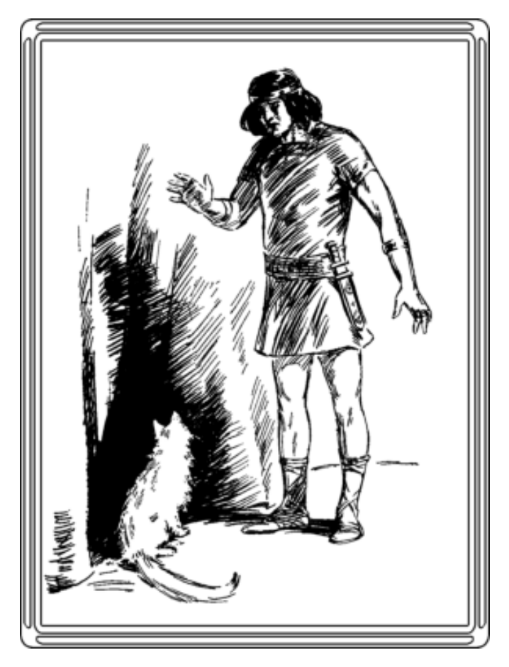
"At the sight of him the prince remembered everything"

what you shall see, and you'll know which you love best, the Princess Eileen or the Princess Kathleen, and you can either go or stay."