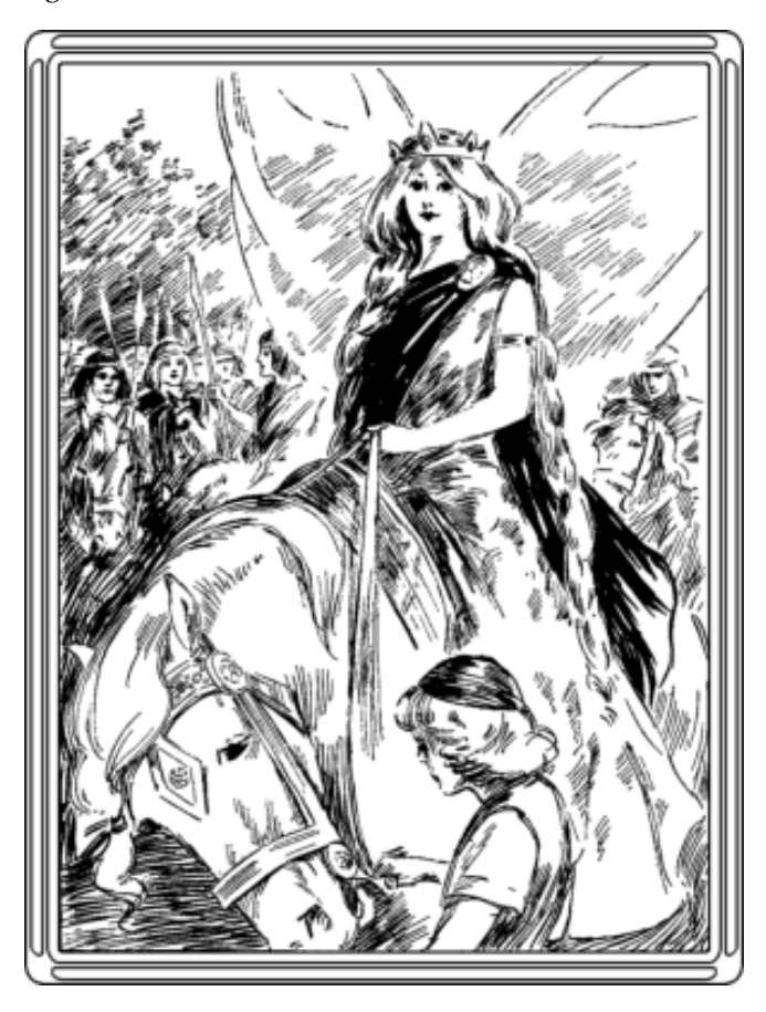
"The queen wished to know if he would join them"

"We shall go on the lake to-day, Cuglas," said the queen, and taking his arm she led him along the water's edge, all the courtiers following.