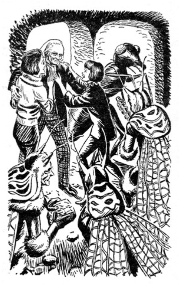
'No... no! What... has happened to him...?' They all looked at each other, troubled, wondering.

All was silent now in the underground tunnel. The figures of the pigmy-menoptera diggers, of Ian and Vrestin, were