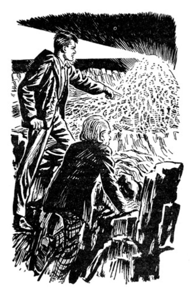
'But what? Come on!'

Doctor Who hesitated, thinking. 'I... wish I knew more of what we are up against...'