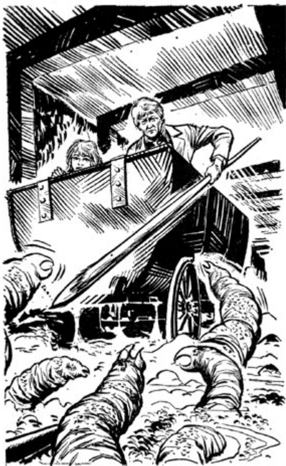
The maggots snapped at the wheels