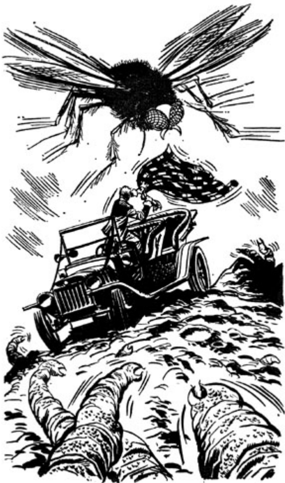
The insect flew straight at the cloak, spitting venom

‘What a beautiful creature,’ said the Doctor. ‘It was trying to kill you,’ said the Brigadier. The Doctor, rather sadly, got back into Bessie. ‘And we