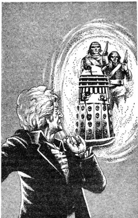
A Dalek was materialising in the tunnel!