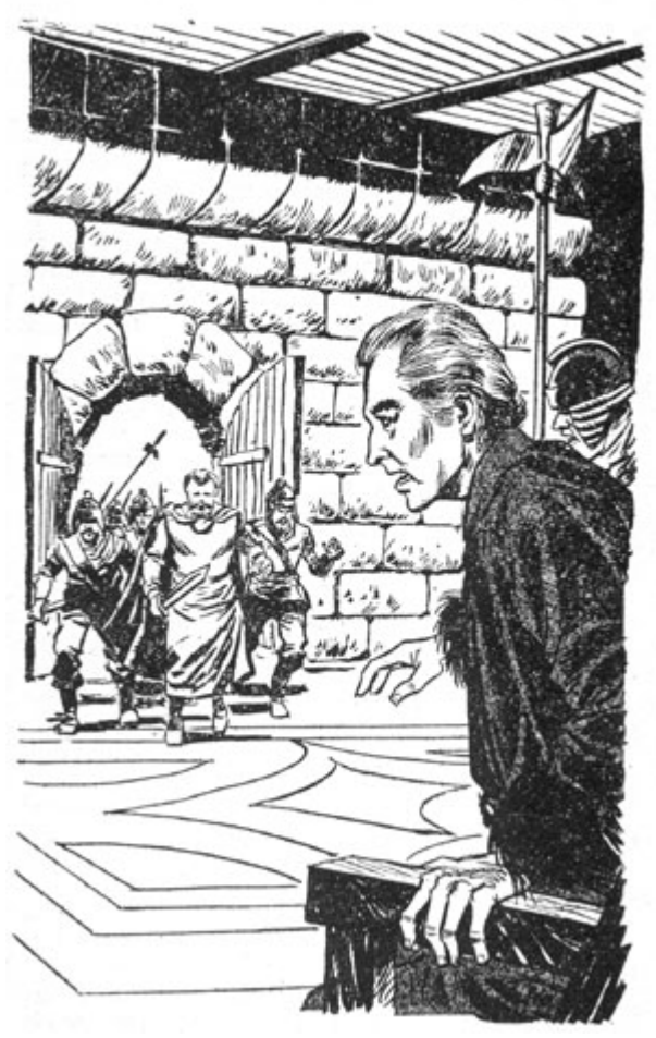
Peladon rose to his feet in surprise and alarm

As the great doors burst open, Peladon rose to his feet in surprise and alarm. He had seen Hepesh, his temple cloak barely hiding the light armour beneath, and, all about him his personal temple guards, evil and menacing in their familiar black helmets. His own Royal Guards reacted