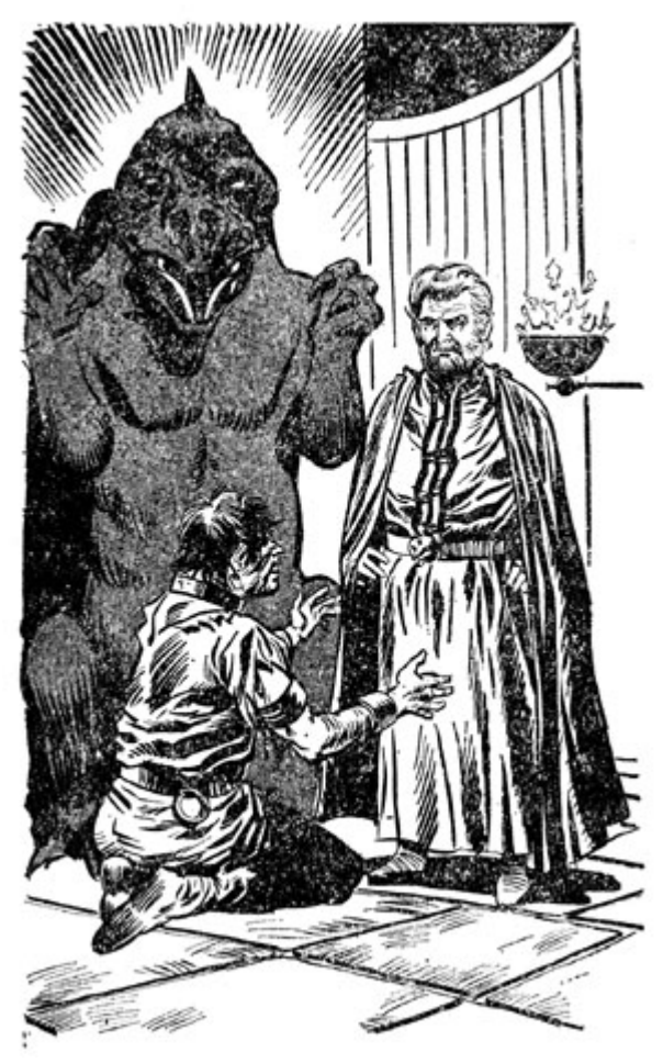
'You are forgiven, Grun.'

Grun looked into the eyes of his High Priest, and saw the anger there, mingling with the power that only Aggedor ordained. He knew he was about to be commanded to a new and urgent task, and, wonderingly,