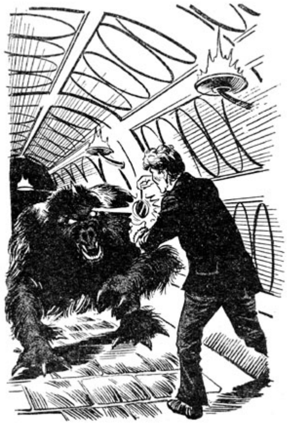
The spinning mirror flashed its pattern of reflected light into the creature's eyes.

irresistible tune... The Doctor stopped chanting, but let the spinning mirror continue to flash its pattern of reflected phosphor light into the creature's eyes, now languid in relaxation. 'Well, Aggedor old chap,' chuckled the Doctor, 'You seem to be very partial to Venusian lullabies, don't you?'