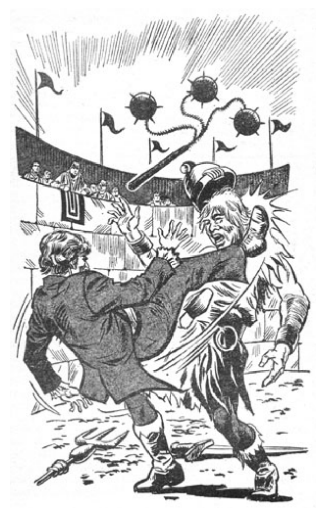
The Doctor launched himself into a flying jump-kick

launched himself into a flying jump-kick. The impact of his out-thrust heels caught the already staggering Grun on