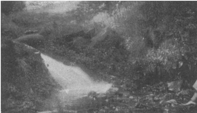
THE FALL OF WATER JUST ABOVE THE SITE OF LAST PHOTOGRAPH