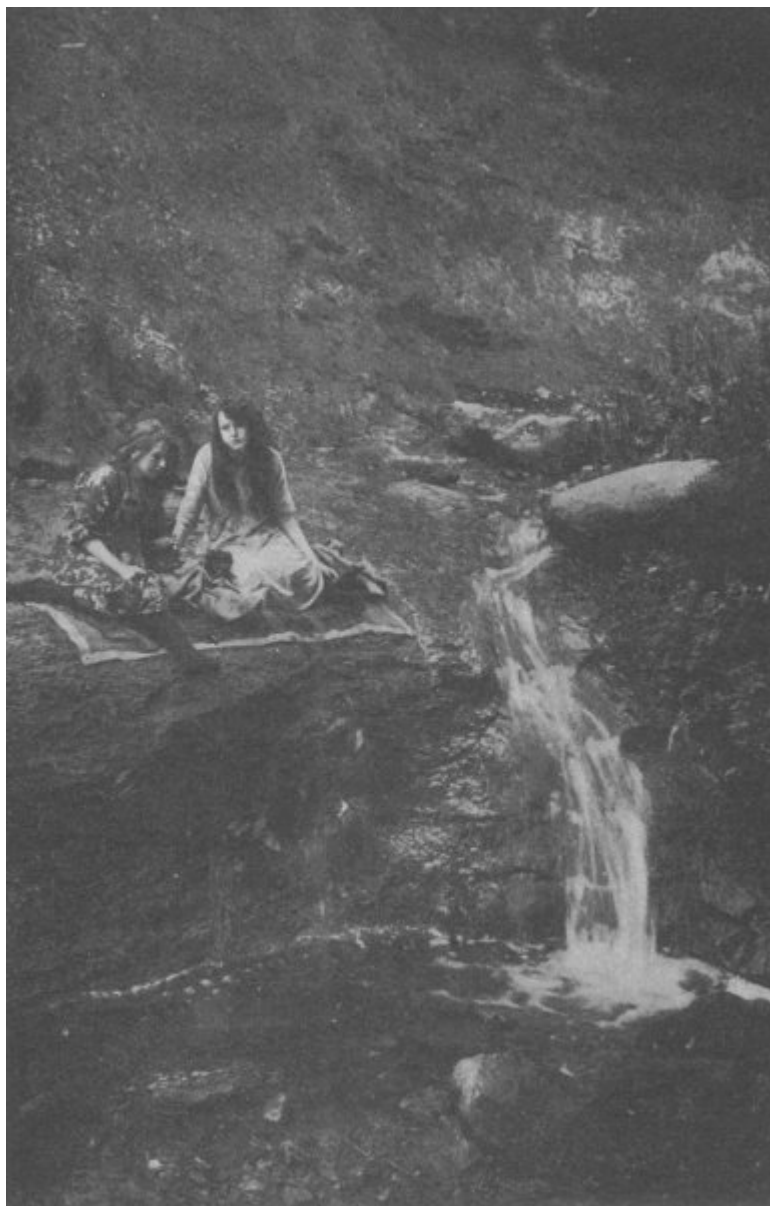
A VIEW OF THE BECK IN 1921