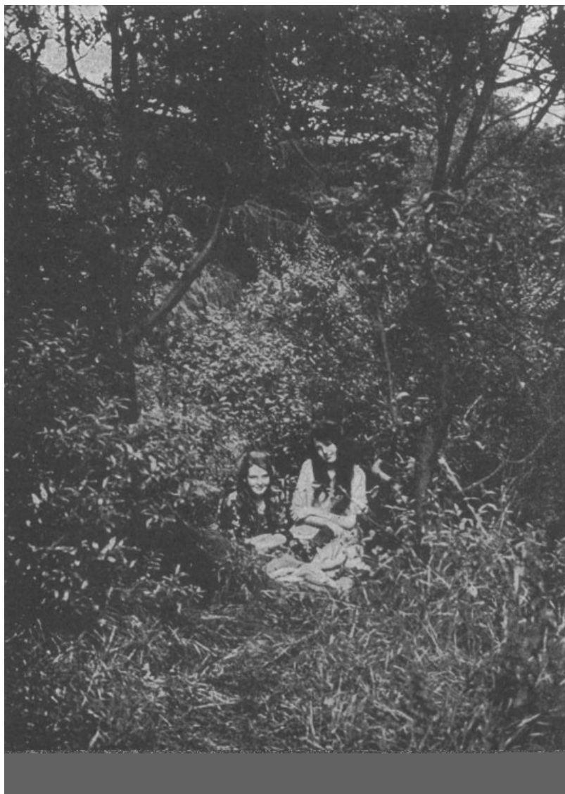
THE TWO GIRLS NEAR THE SPOT WHERE THE LEAPING FAIRY WAS TAKEN IN 1920