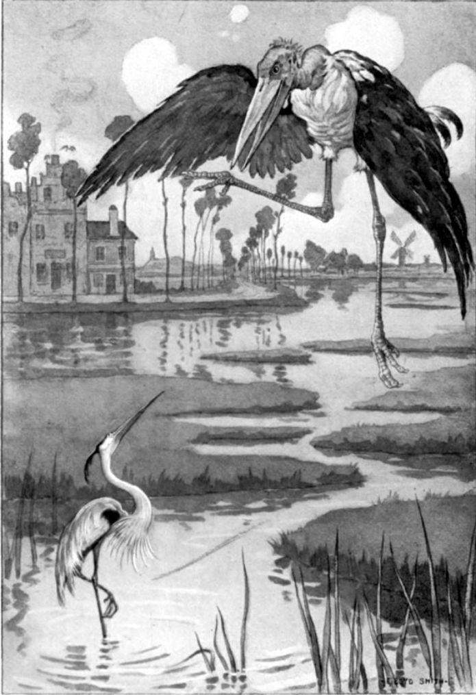
Mr. Stork and Miss Heron