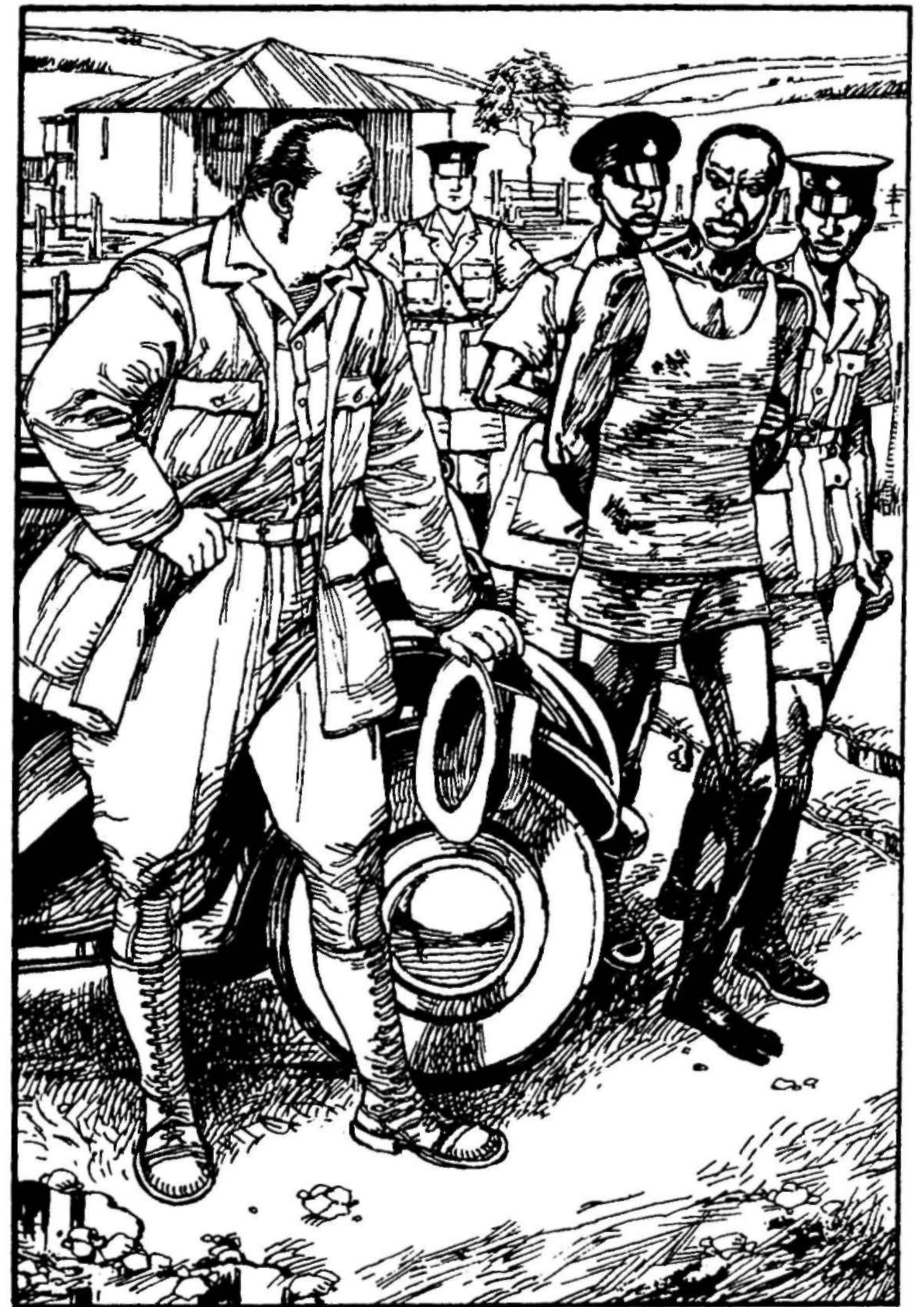
Charlie walked towards Moses and looked directly into his face. The man looked back without expression. For a moment Charlie's face showed fear.

Charlie examined the young man. Another soft boy with a private education who had come to Africa to learn to be a farmer. They were all so similar. They usually came with ideas of equality, and were often shocked at first by the way whites behaved towards the natives. A few months later these young men had become stronger and harder and learnt to accept the way things were. If Tony Marston had spent a few more months in the country it would have been easy. That was Charlie's feeling.