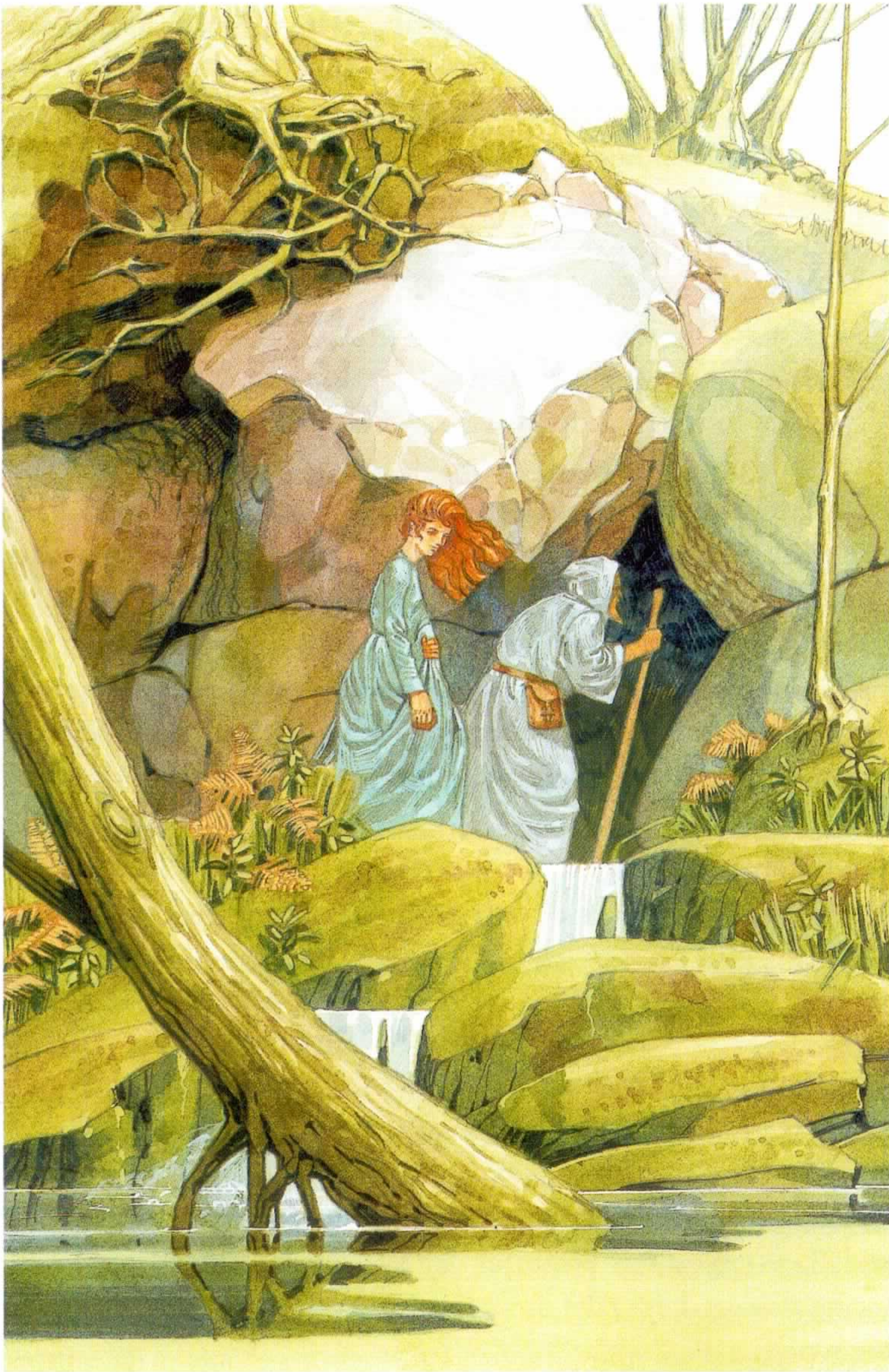
So Merlin went into the cave first.

All day they enjoyed the sun. In the afternoon they sat under the tall green trees. They ate and they talked. Then evening came.