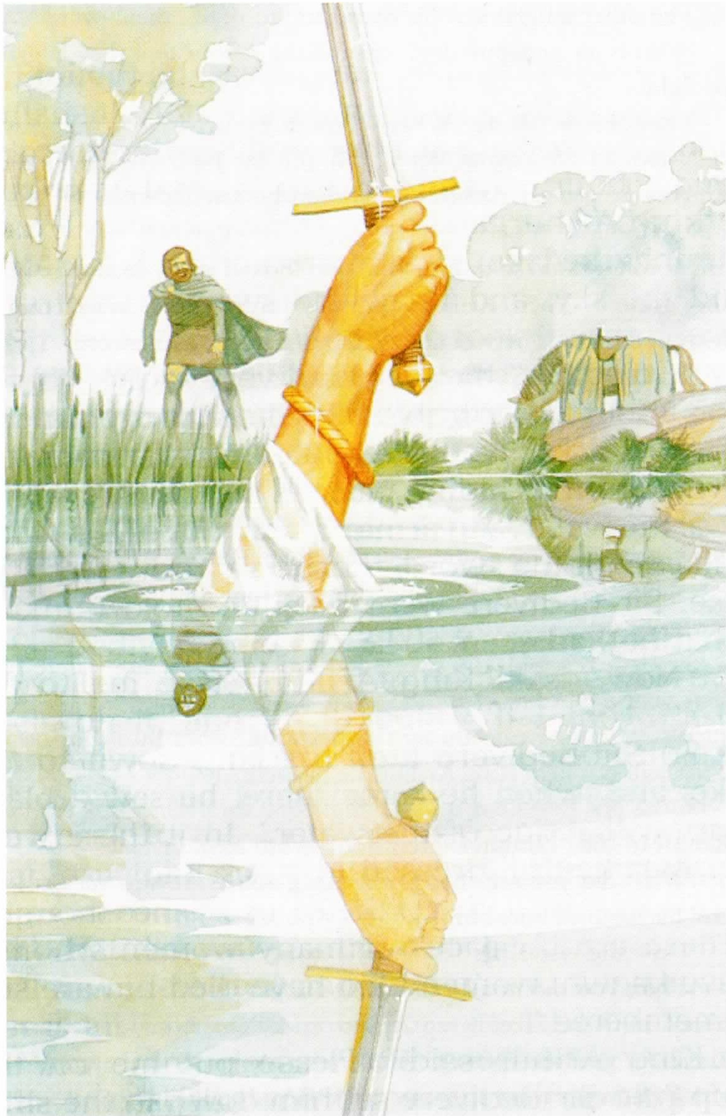
An arm came up out of the water and caught the sword.

it. Then I will always remember King Arthur.'