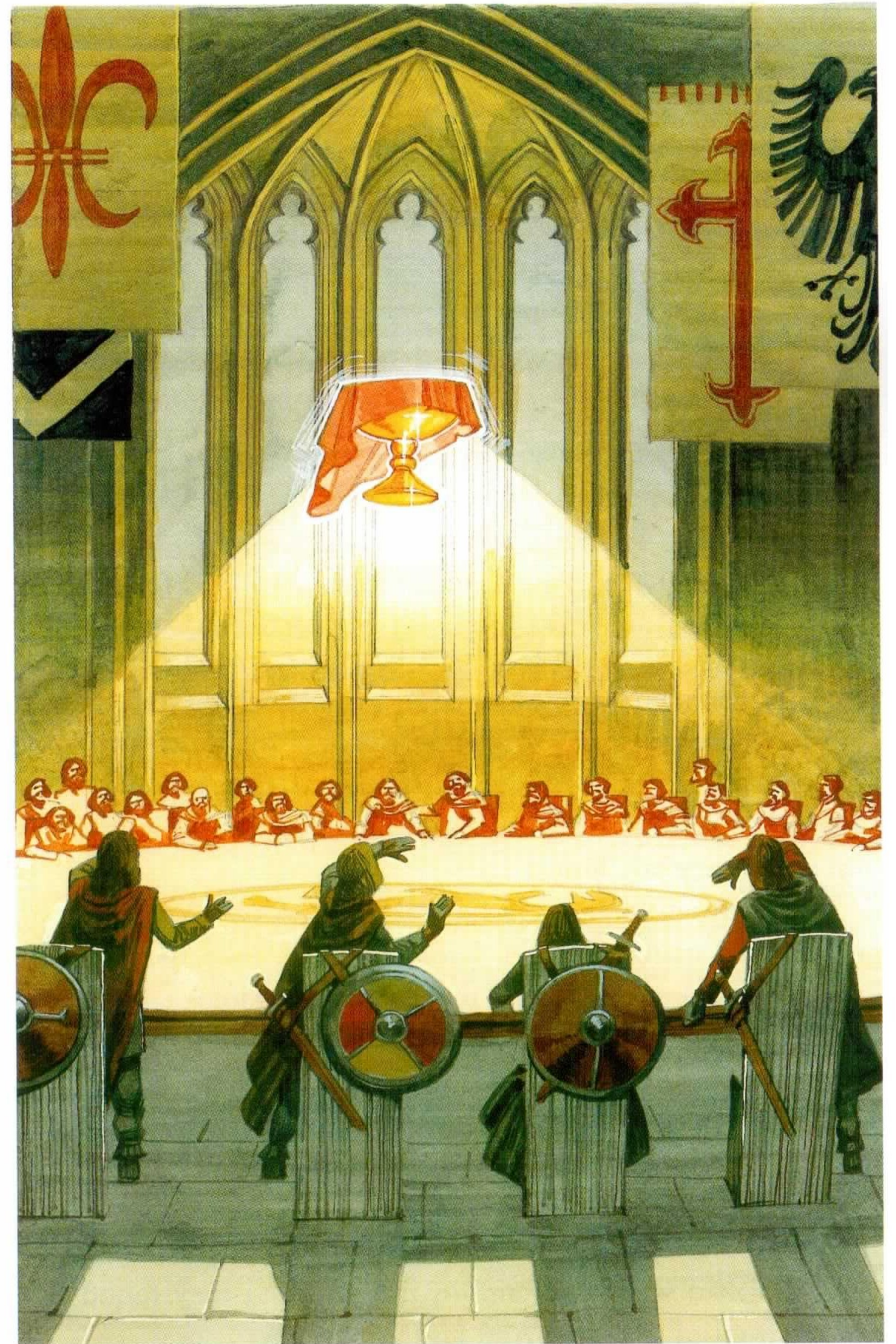
They looked up and saw a gold cup above the table.