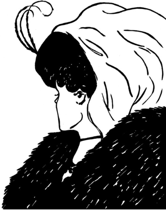
Figure 2: Old Lady or Young Girl?

We see above a famous perceptual illusion in which the brain switches between seeing a young girl and an old woman. An anonymous German postcard from 1888 depicted the image in its earliest known form, and a rendition on an advertisement for the Anchor Buggy Company from 1890 provided another early example.