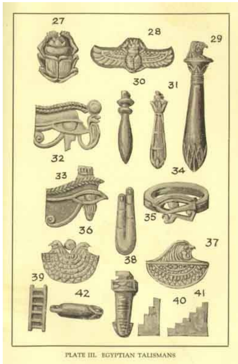
PLATE III. EGYPTIAN TALISMANS

purpose, poise, and stability. Later it was one of the hieroglyphic signs of the sun-god Ra, and represented the one supreme power casting his eye over all the world, and instead of the point within the circle is sometimes represented as a widely open eye. This symbol was also assigned to Osiris, Isis, Horus, and Ptah; the amulet known as the Eye of Osiris being placed upon the incision made in the side of the body--for the purpose of embalming--to watch over and guard the soul of the deceased during its passing through the darkness of the tomb to the life beyond. It was also worn by the living to ensure health and protection from the blighting influence of workers in black magic, and for the stability,