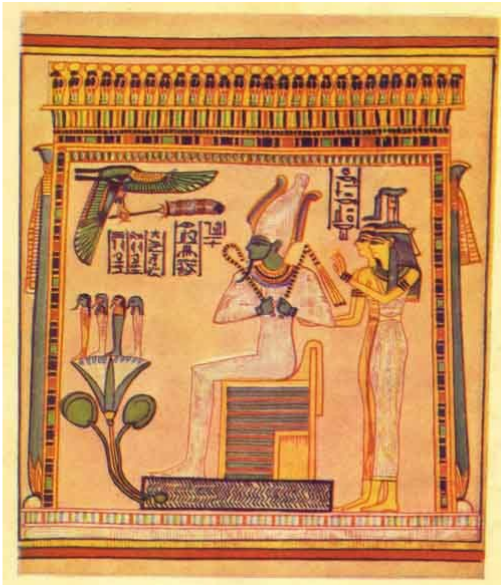
OSIRIS KHENTI AMENTI, the Great God, seated in his shrine of fire. In front of Osiris is the Eye of Horus and behind him stand the Goddesses ISIS and NEPHTHYS.

From the Papyrus of Hunefer in the British Museum