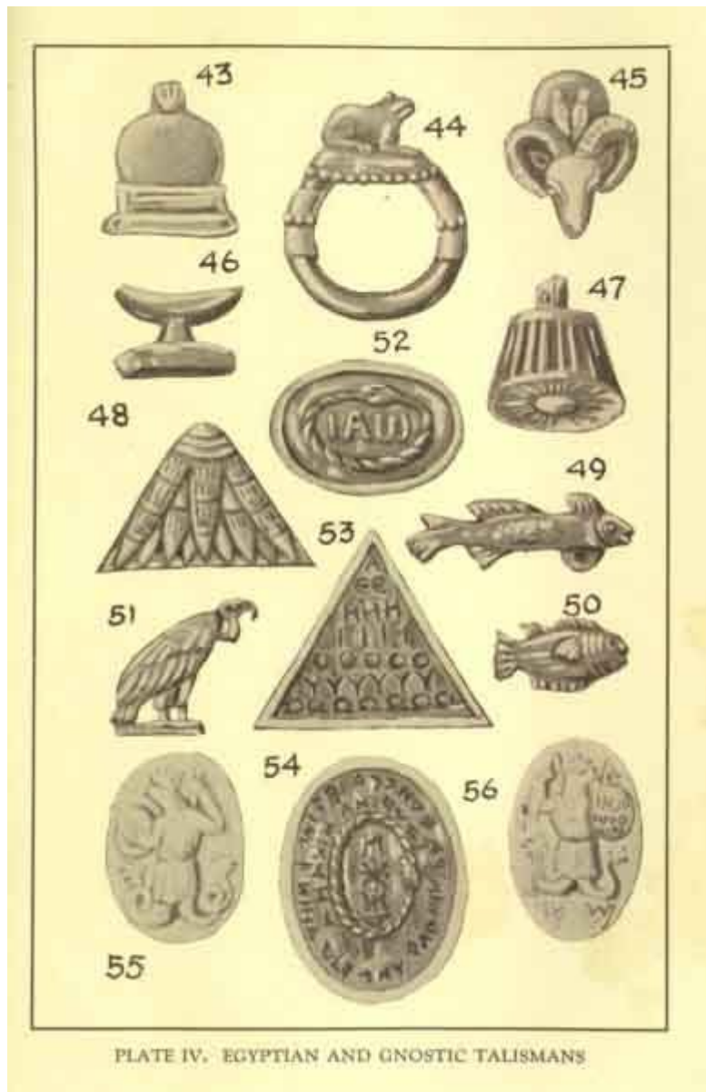
PLATE IV. EGYPTIAN TALISMANS

The Fish talisman (Illustrations Nos. 49, 50, Plate IV ) is a symbol of Hathor--who controlled the rising of the Nile--as well as an amulet under the influence of Isis and Horus. It typified the primeval creative principle and was worn for domestic felicity, abundance, and general prosperity. The Vulture talisman (Illustration No. 51, Plate IV ) was worn to protect from the bites of scorpions, and to attract motherly love and protection of Isis, who, it was believed, assumed the form of a vulture when searching for her son Horus, who, in her absence, had been stung to death by a scorpion. Thoth, moved by her lamentations, came to earth and gave her "the words of power," which enabled her to restore Horus to life. For this