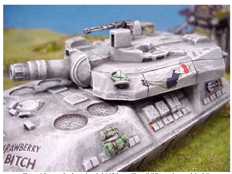
Fig. 6.IcarusIndustries M4620cm "hog" "Strawberry bitch" Rocket Propelled Artillery ACV with infantryman from the Thunderbolt Legion. (Model conversion based on a vehicle by Ground Zero Games, painted by JohnTreadaway . Figure by Denizen Miniatures, painted by Graham Green and photography JohnTreadaway , copyright SouthLondon Warlords)

The M46 is in use with a few standing armies and mercenary units. It is over all a rather larger vehicle than the M18 as it uses a lighter variant of the M1 tank hull as its 'donor' vehicle. Some of the M46's are new builds but many are conversions from refurbished M1 chassis'. The M1 is well suited to this kind of role because of its flexible, modular construction. The M46 has four fans removed from the basic hull, reducing the number to four and the space afforded by this change in running gear is put to good use with crew seating and ammunition storage. The rear hull is reduced to just under 0.5metres in height and a large turret ring for the spacious 2.5metre tall turret sits upon that. Manufactured from luminium and ceramic composites, the turret gives protection from shell splinters and small arms fire to its crew.