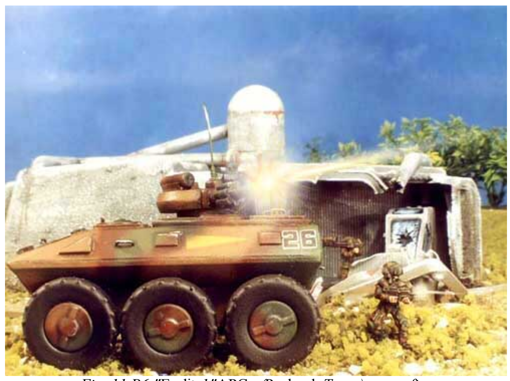
Fig. 11.P6 "Egalite1" APC, (Panhard, Terra) opens fire. (TheCompagnie deBarthe).