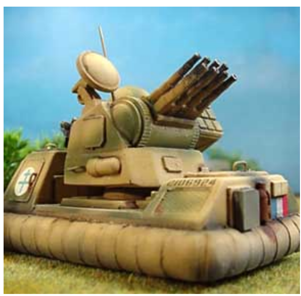
Fig. 9.Panzerkampfwagen47 "Panther II" (Henschel, TerraTheCompagnie deBarthe). Model by Ground Zero Games, Painted by KevinDallimore, photography JohnTreadaway, copyrightSouthLondon Warlords)