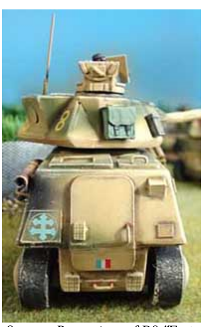
Fig. 12.Pan8_rear- Rear view of P8 "Fraternite" APC, (Panhard, Terra, TheCompagnie deBarthe). Model by Ground Zero Games, Painted by KevinDallimore, photography JohnTreadaway, copyrightSouthLondon Warlords)

Model by Ground Zero Games, Painted by KevinDallimore, photography JohnTreadaway, copyrightSouthLondon Warlords)