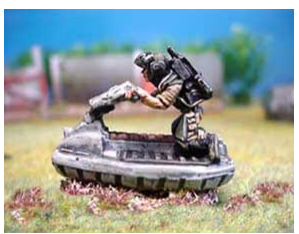
Fig. 8.Infantry Skimmer, (F.N., Friesland) Model by Ground Zero Games, painted by Graham Green, photography JohnTreadaway, copyright South London Warlords)