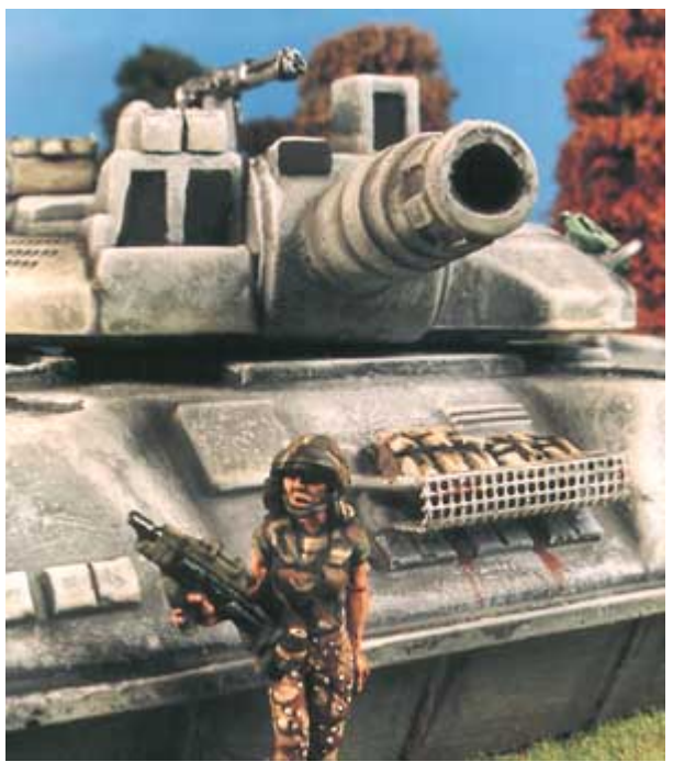
Fig. 7. Icarus Industries M4620cm "hog" "Strawberry bitch" Rocket Propelled Artillery ACV. (Model conversion based on a vehicle by Ground Zero Games, painted and photographed by JohnTreadaway, copyright SouthLondon Warlords)

Combat weight, depending on model, armour packages and ammunition stowage, can vary between 40 and 60tonnes and manoeuvring ability and cross country performance is only slightly degraded from the other "blower" vehicles it accompanies; this is due more to having a higher centre of gravity than because of any particular degradation of power to weight ratio.