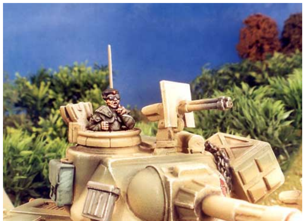
Fig. 13. Turret commander P8 "Fraternite" APC, (Panhard, Terra, TheCompagnie deBarthe). Model by Ground Zero Games, Painted by KevinDallimore