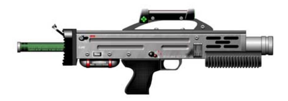
Fig. 3. HeuvelmanIA17,2cm Infantry Powergunwith magazine tube waiting to be loaded (JohnTreadaway)

Powergunscame in all sizes from 1-2 cm infantry weapons to 15-25 cm heavy tank guns. Starships and planetarydefence systems used similar weapons of up to 100 cm diameter. Quick-firing guns of 1-3 cm could be manufactured and these were commonly grouped into multi-barrelled, anti-personnel and air defence weapons, gatlings or calliopes. One tactical quirk is that powergun shots released all their energy on the first thing they hit, even soft cover could be protective to a target, at least for the first shot. Powerguns were expensive and difficult to manufacture but were the standard Terran military weapon.