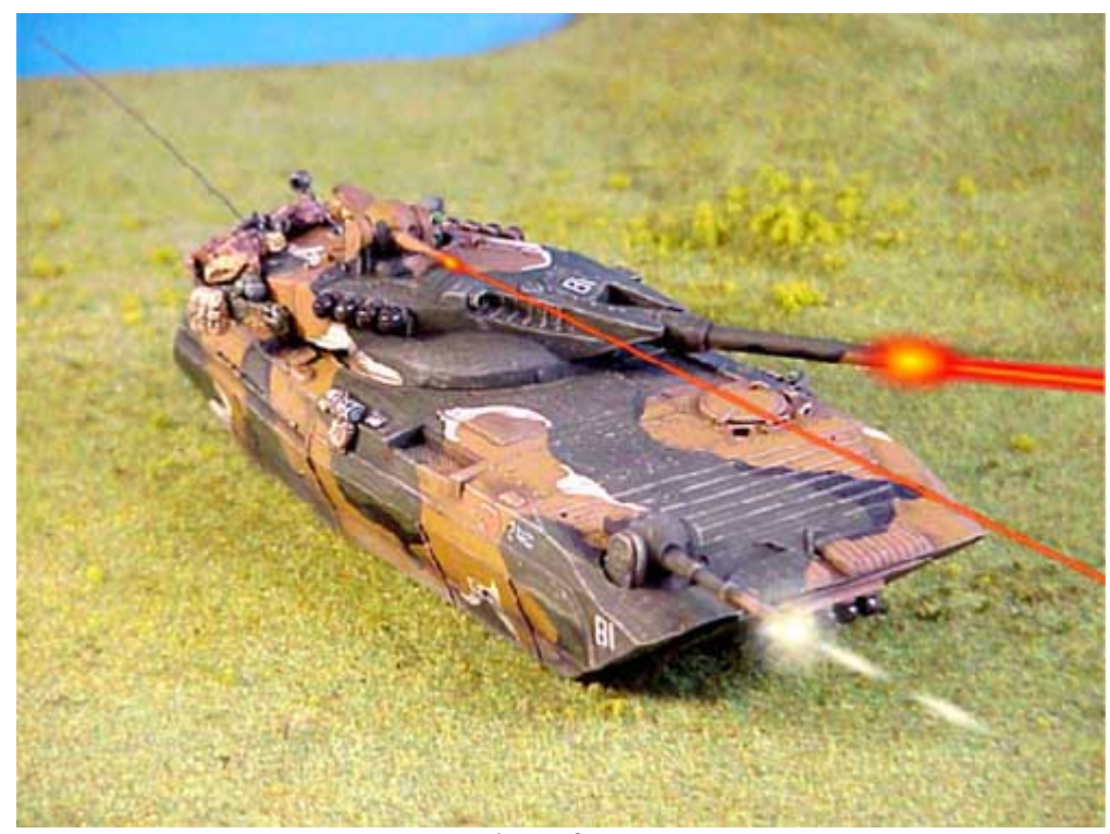
Fig. 10. Panzerkampfwagen 60 "Maus" (Henschel, Terra as used by a number of planetary forces) opens fire. Model scratch built/conversion by JohnTreadaway, Painted by Graham Green, photography JohnTreadaway, copyright South London Warlords)